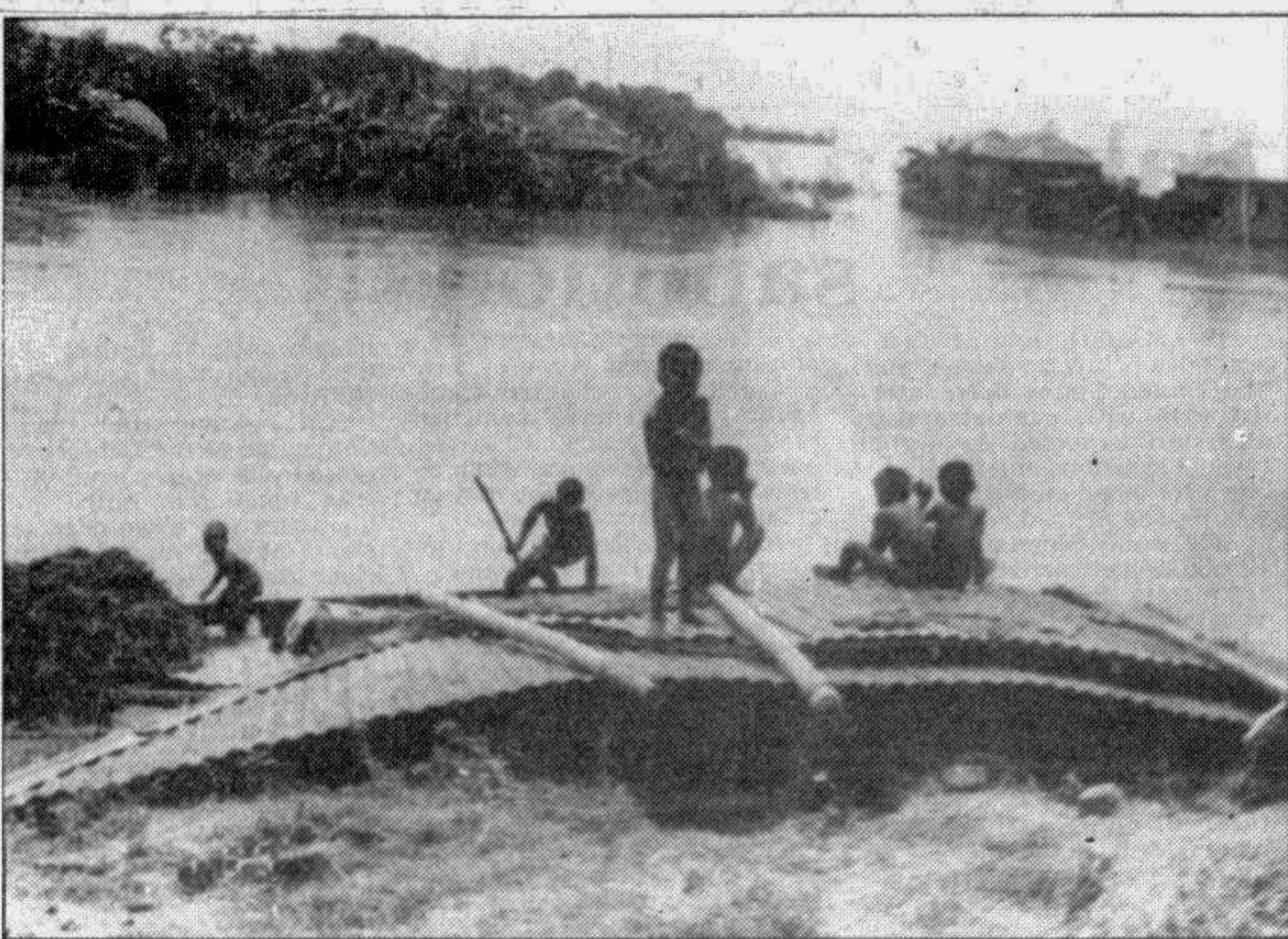
PABNA: Flood affected people have taken shelter on an embankment near an inundated village at Shahzadpur thana.

The district administration sources said the 'Jalmahals' or haors are given lease by the Land Ministry on a three-year term.