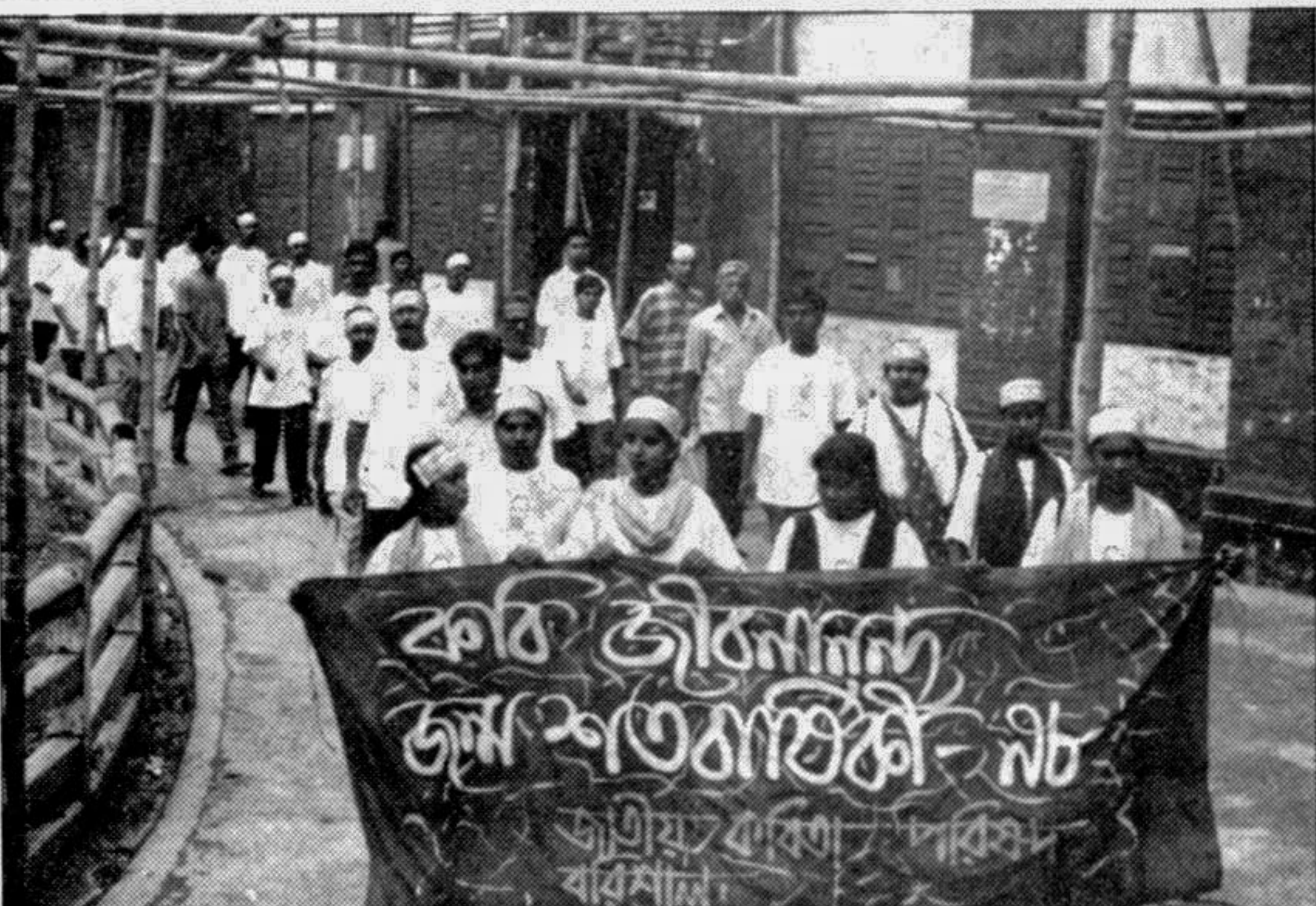
BARISAL: Local unit of Jatiya Kabita Parishad brought out a colourful rally here recently in observance of birth centenary of Poet Jibananda Das.