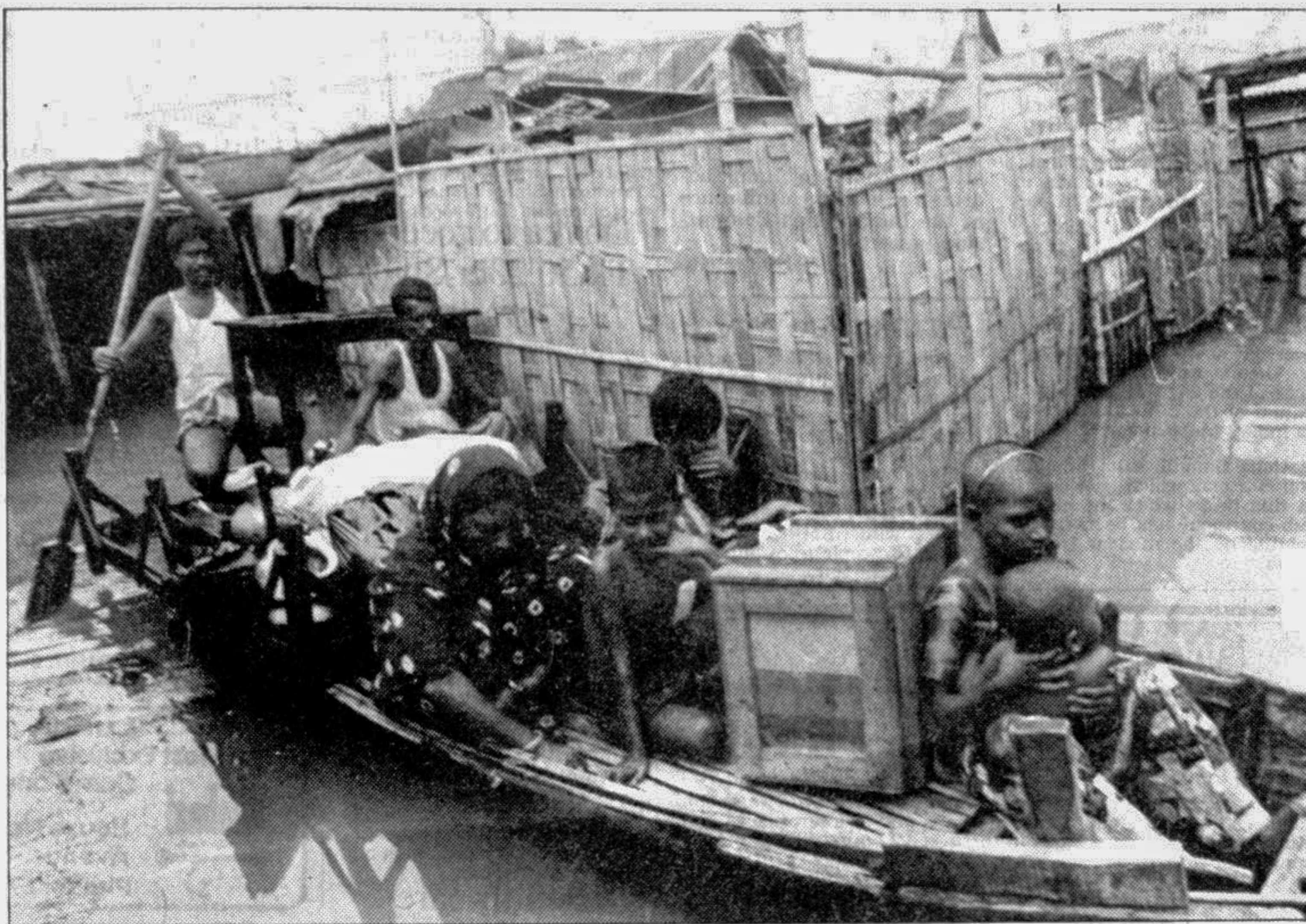
A flood-affected family in a low-lying area of the city leaving their house for a safer place yesterday.

Gainers outnumber losers on DSE Pages 6, 7, 8