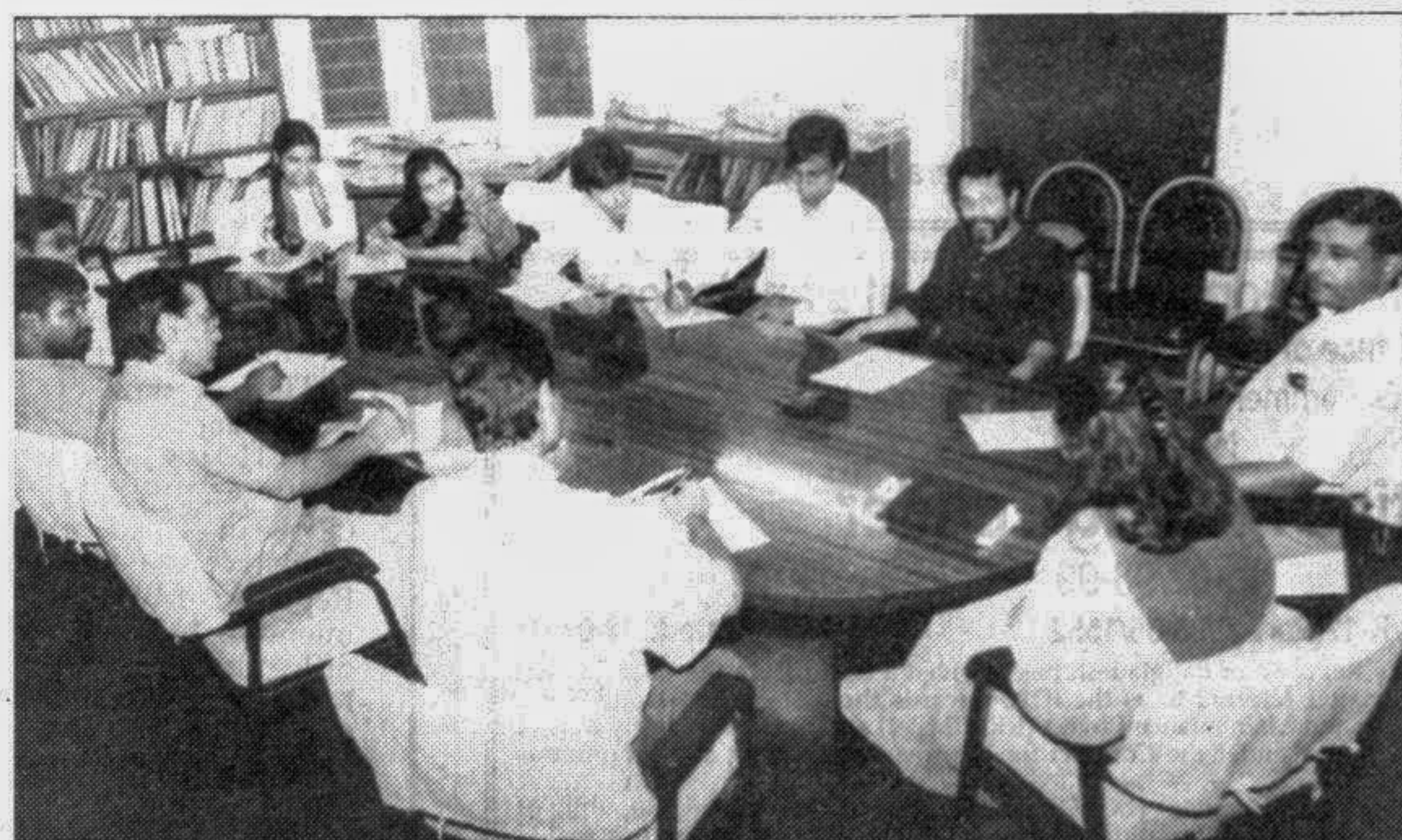
Participants at The Daily Star mini-roundtable on 'Public Toilets in City' held at the conference room at its office yesterday.