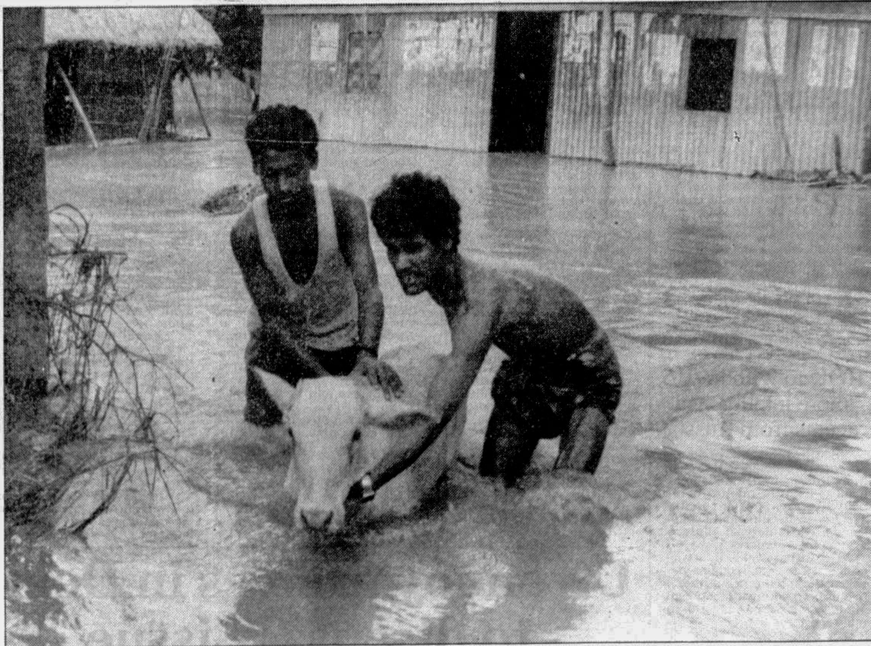
COMILLA: A vast tract of land of Bhubangar area in the district was inundated following breach in the Gumti embankment. Photo shows two flood affected men shifting their cow to safer place.