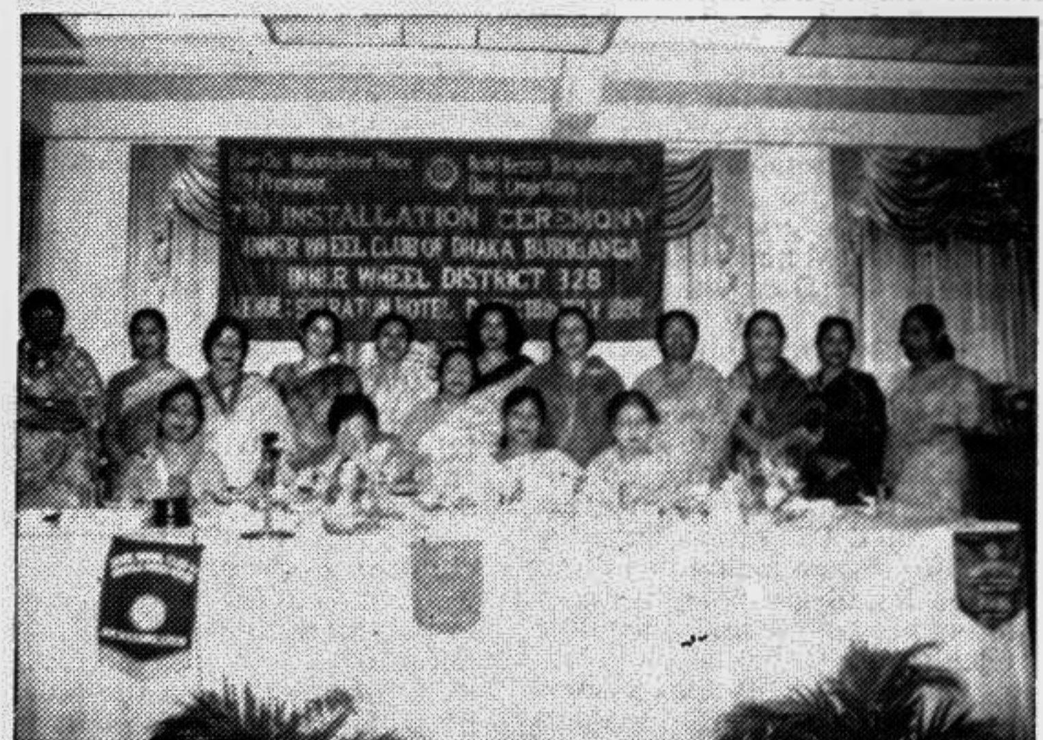
The installation ceremony of newly elected office-bearers of Inner Wheel Club of Dhaka Buriganga was held at a city hotel on Saturday.