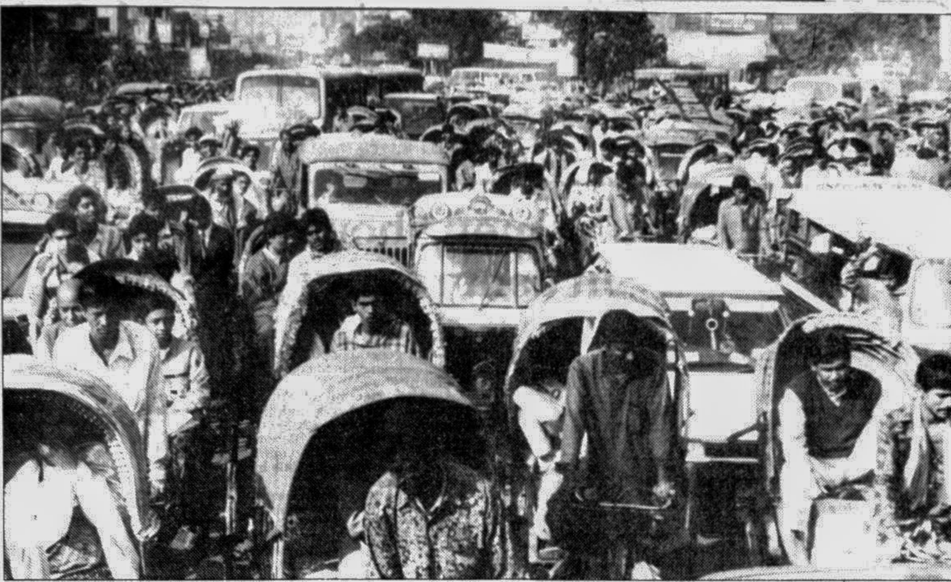
This photograph taken during drizzle yesterday at city's New Market area amply reflects total breakdown of traffic system.