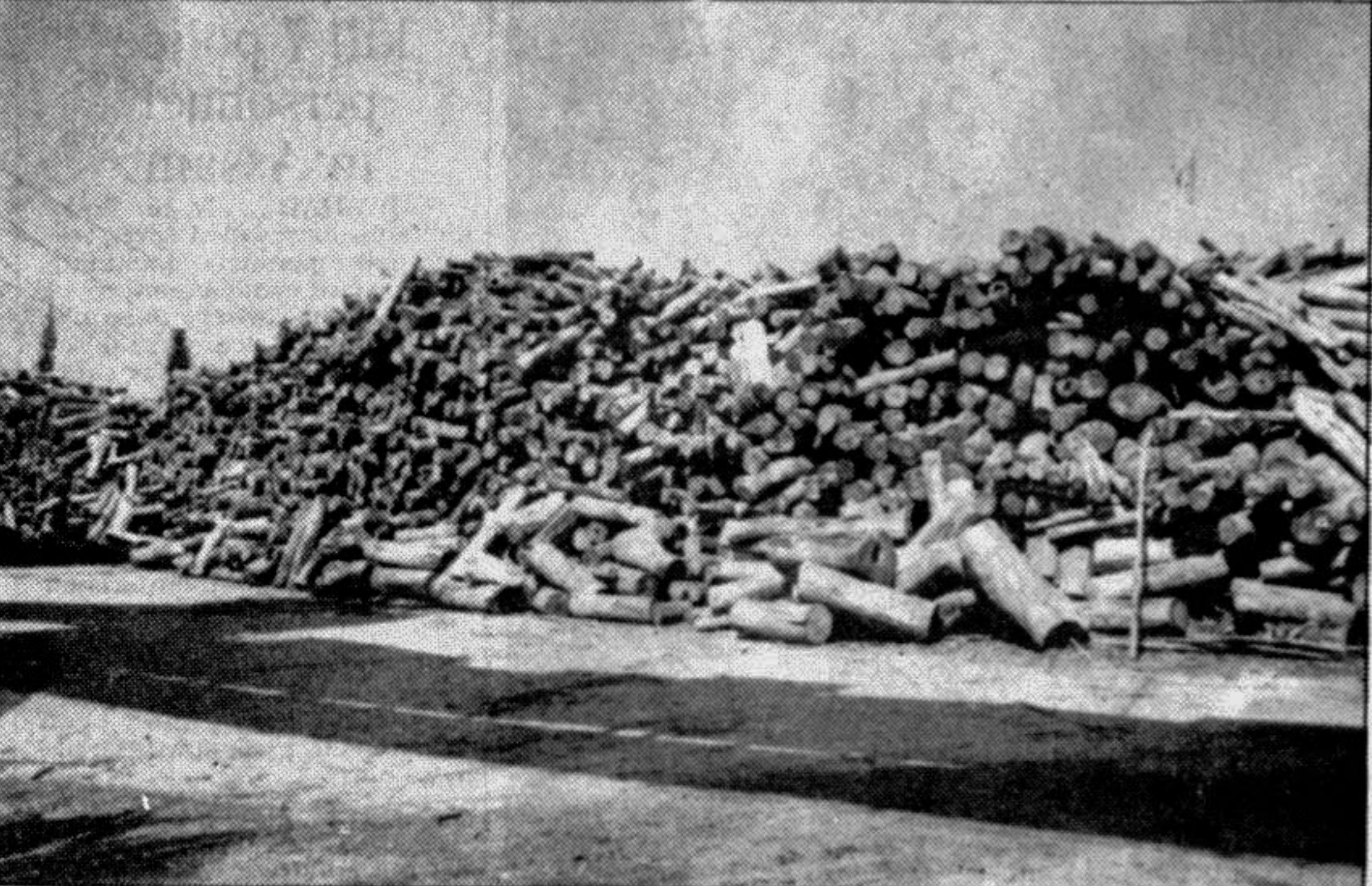
SYLHET: Several thousand tonnes of soft wood procured for production of pulp have been lying under open sky and getting damaged in the premises of Sylhet Pulp and Paper Mills (SPPM) at Chhatak. The BCIC concern remained shut down for over 3 months since a huge amount of money of the mills have been lying outstanding with different buyers.