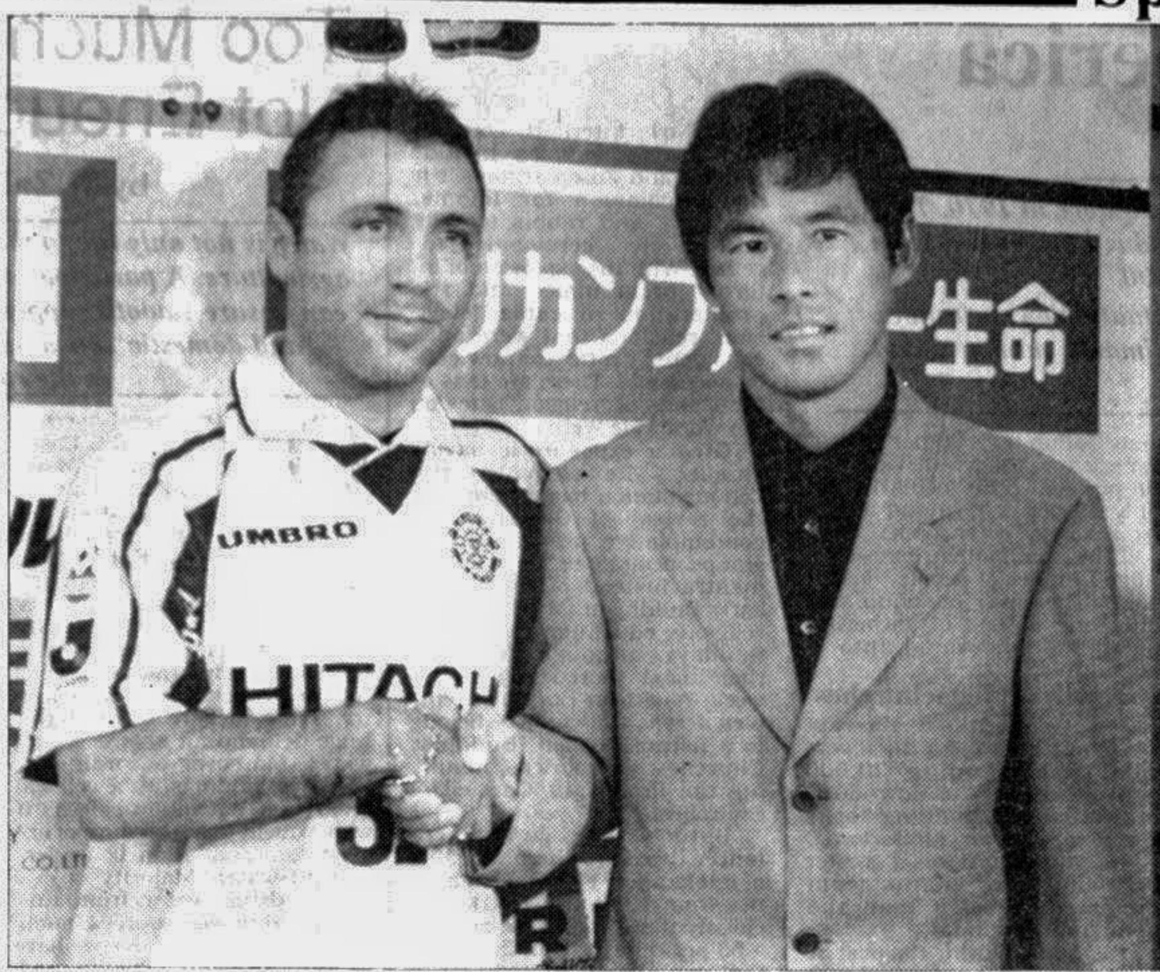
Bulgarian superstar Hristo Stoichkov (L) being greeted by J-League side Kashiwa Reysol's head coach Akira Nishino during a media conference at Kashiwa on July yesterday. Stoichkov has recently signed for the club.

BONN, July 17 (Reuters): Schalke 04 general manager Rudi Assauer wants Bert Vogts sacked as German national team coach, the Bild newspaper reported today. Bild quoted Assauer as saying Vogts had failed to get the most out of the German squad, who lost 3-0 to Croatia in the World Cup quarterfinals. "What really annoys me is what Vogts did with what was basically a good team, any Bundesliga coach would certainly have got more out of them," the paper quoted Assauer as saying. "For me, there can only be one conclusion — Bert has to go straight away and the entire coaching staff with him," said Assauer, who has clashed bitterly with Vogts in the past. German soccer bosses were scheduled to hold talks with Vogts at a meeting later today. The coach has signalled he wants to stay in the job and the German soccer federation (DFB) has so far offered him its backing. Vogts has come under media and public pressure to quit after eight years in charge. Assauer insisted his opinion was widely shared inside German soccer, even though no other big names have called publicly for the coach to go.