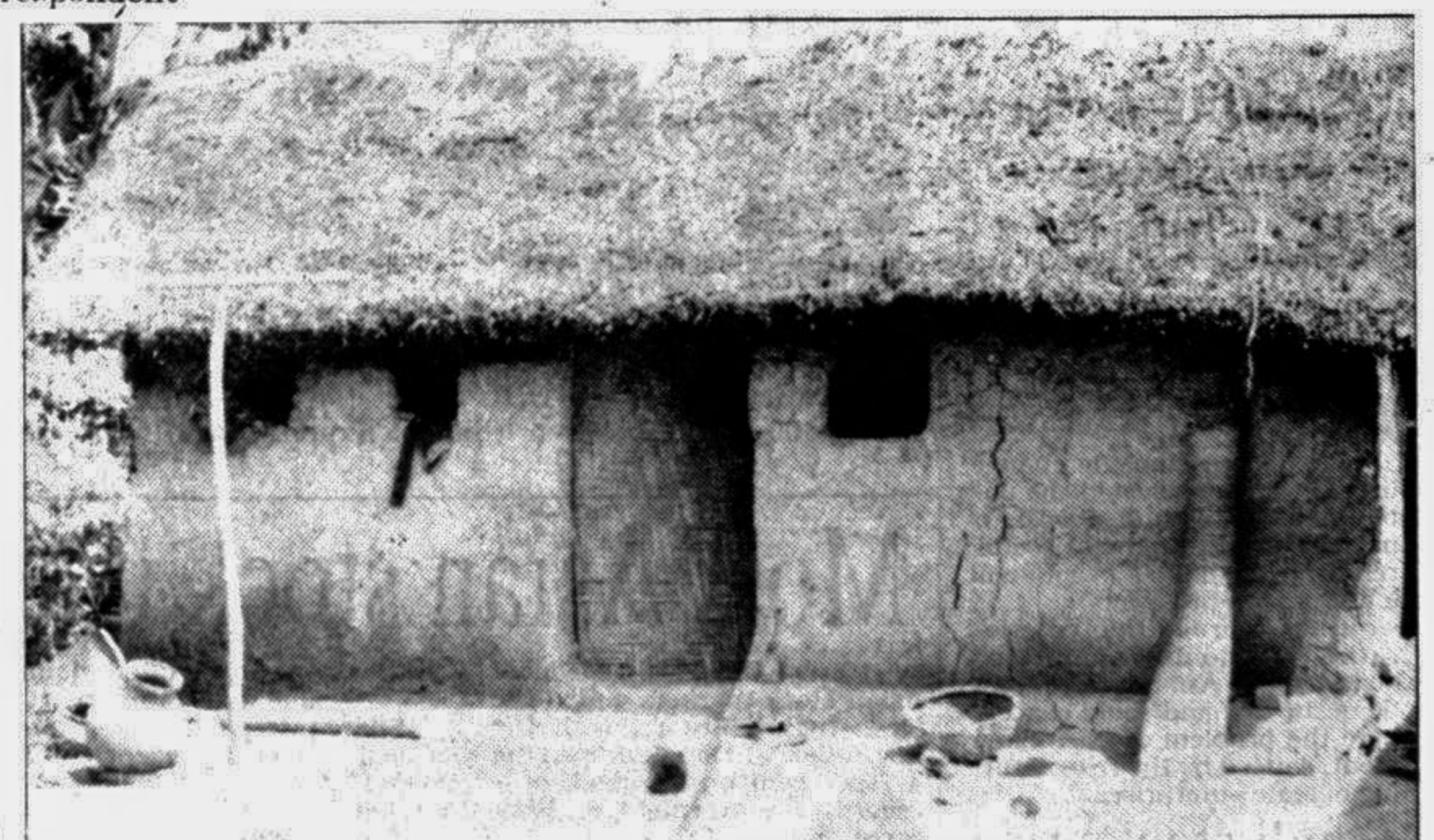
A typical house of aboriginals.

lands of aboriginals. Influential people have been taking possession of the lands of aboriginals forcibly. Instances of unauthorised occupation of land may be cited. A total of 3.39 acres of land of khatian No 177 of Panchpukuria mauza of Dinajpur district have been occupied by the influential groups. A former officer of Telegraph and Telephone Department of Rajshahi area said to have done the same incident and has occupied lands of some aboriginals.