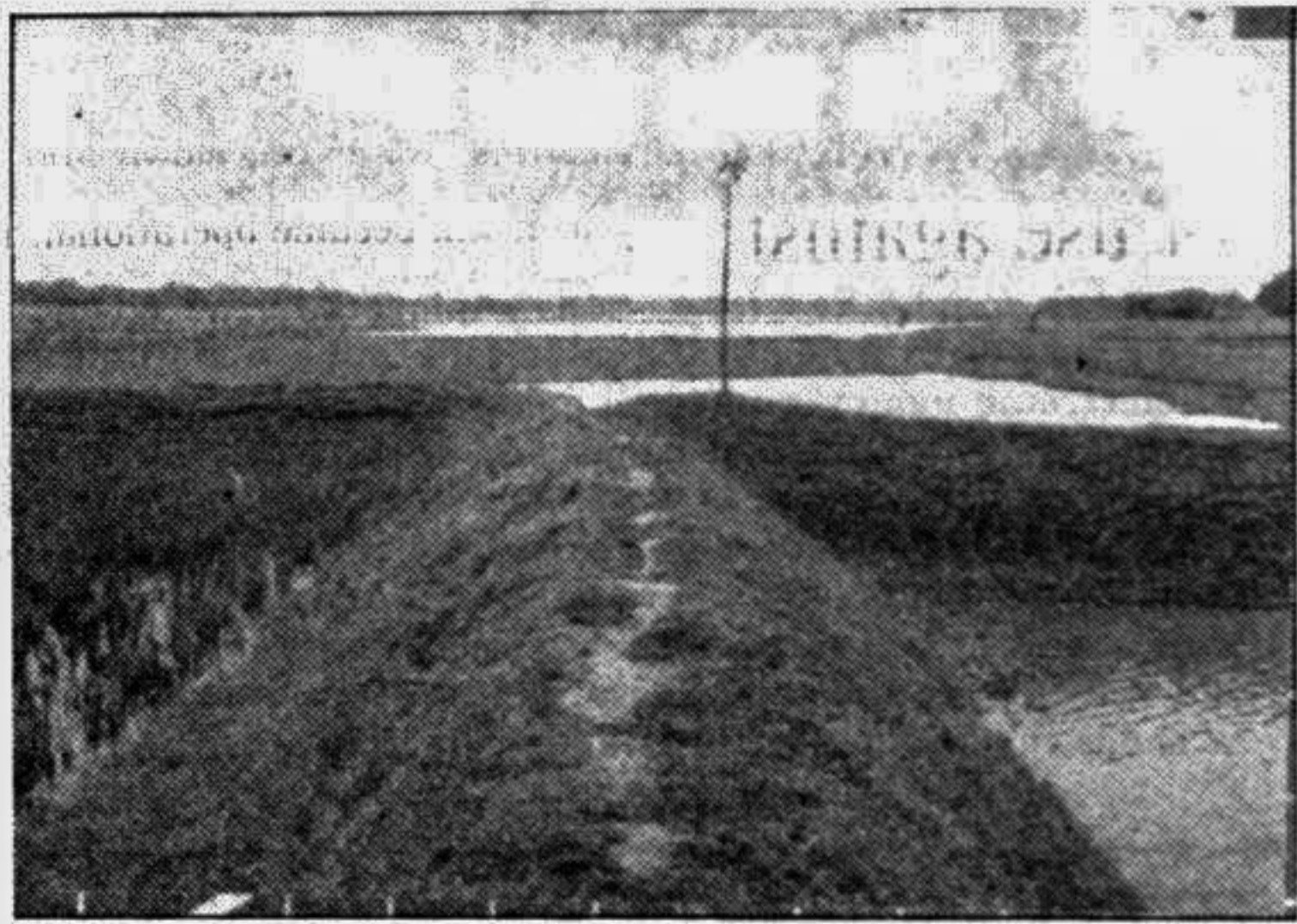
MYMENSINGH: Two illegal ponds on marshy land of Char Haripur.

Hundreds of people told this correspondent that if these embankments were damaged, at least 500 acres of crop land and their houses would be flooded during the rainy season. They also informed that they would not be able to bring their lands under IRRI-Boro cultivation programme due to lack of irrigation facilities in the dry season. Not only that they would be deprived of separating fibre from jute plants due to lack of rotting, they alleged.