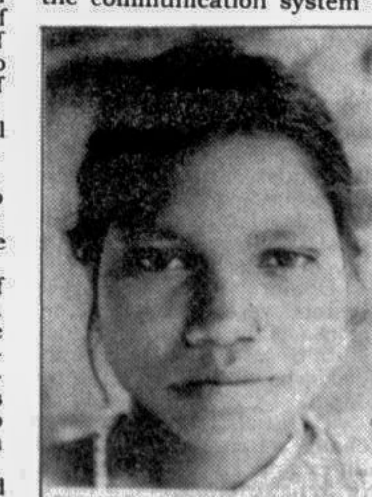
Innocent face of an aboriginal young girl.