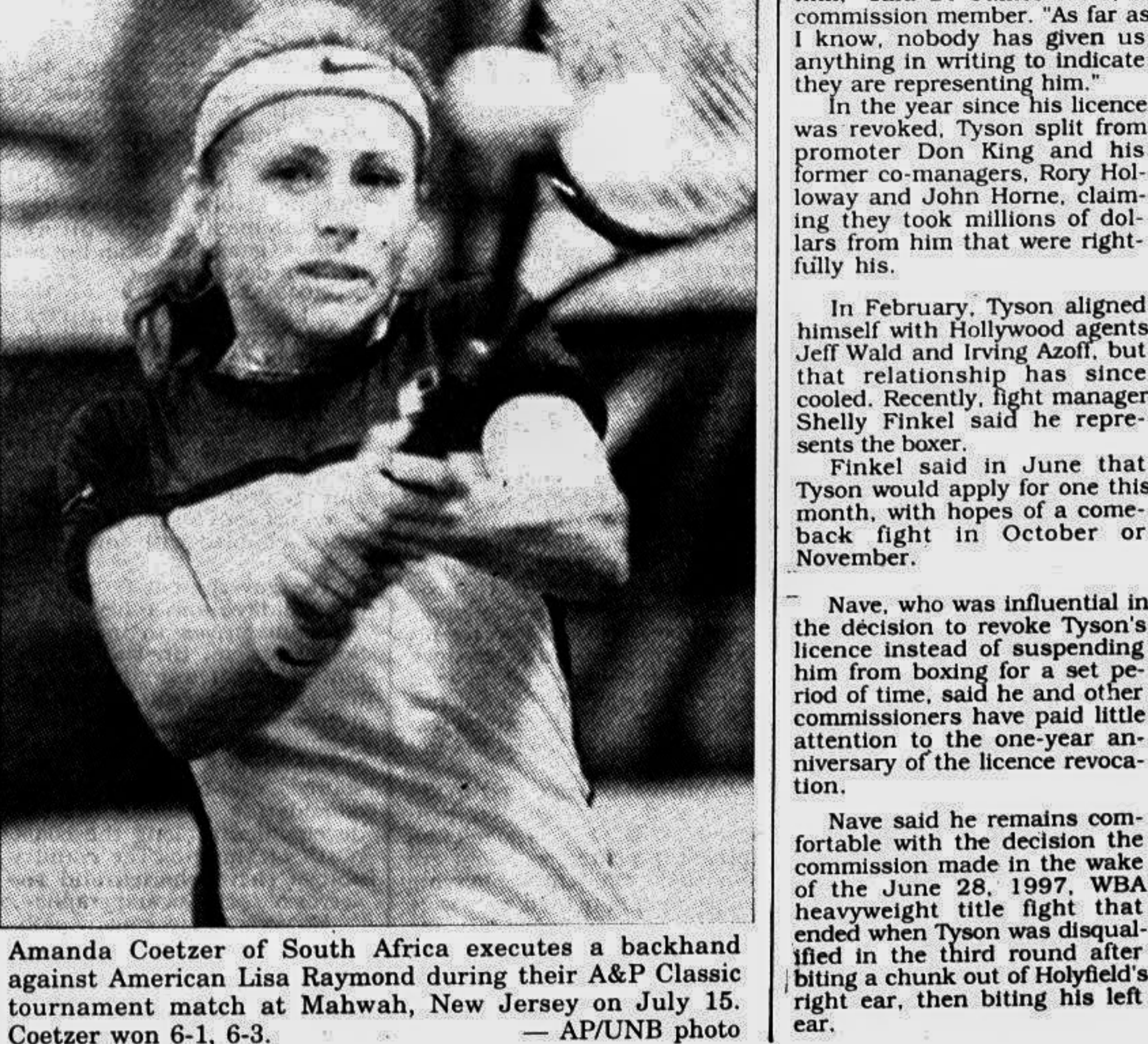
Amanda Coetzer of South Africa executes a backhand against American Lisa Raymond during their A&P Classic tournament match at Mahwah, New Jersey on July 15. Coetzer won 6-1, 6-3.