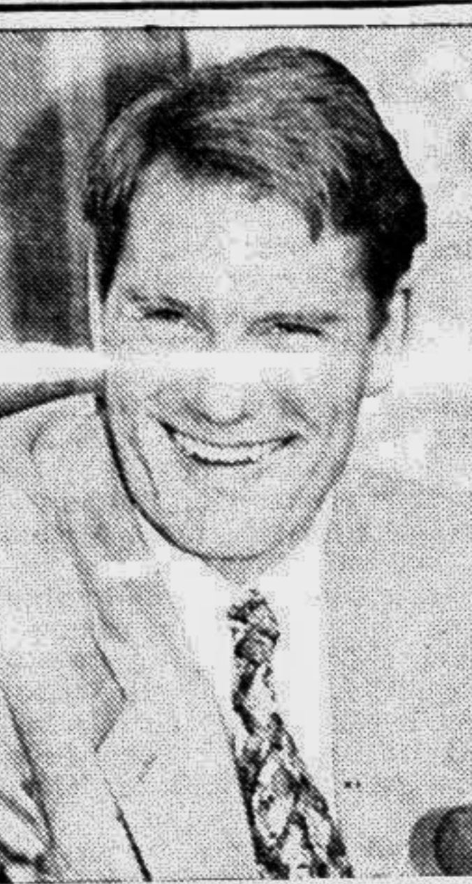
Glenn Hoddle (England soccer manager) 'Revenge is a horrible word.'