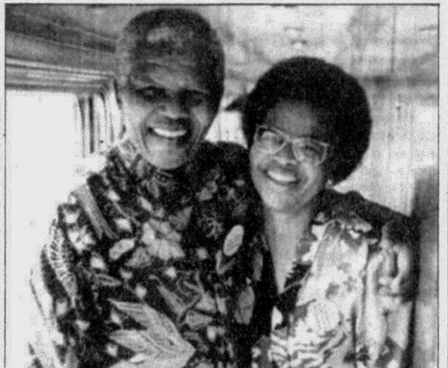
South African President Nelson Mandela stands with Graça Machel, wife of the late former president of Mozambique Samora Machel. South African news reports said that the couple are expected to get married tomorrow, Mandela's 80th birthday, at a private ceremony at the President's Houghton home in Johannesburg.