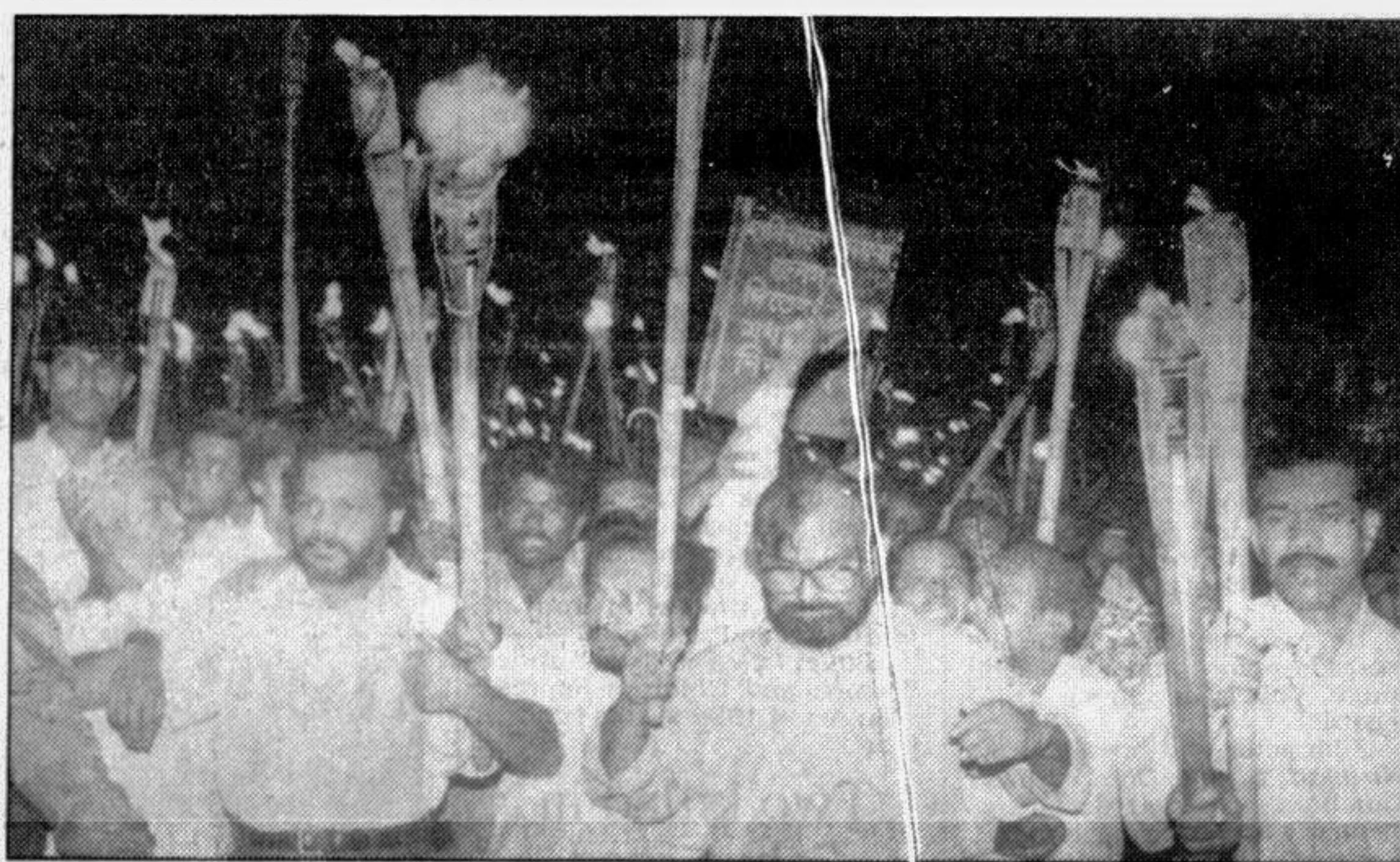
BNP brought out a torch procession in the city yesterday to drum up support for today's half-day hartal.

The cross-examination of the IO concluded yesterday. Judge Golam Rasul adjourned the hearing to resume on July 20.