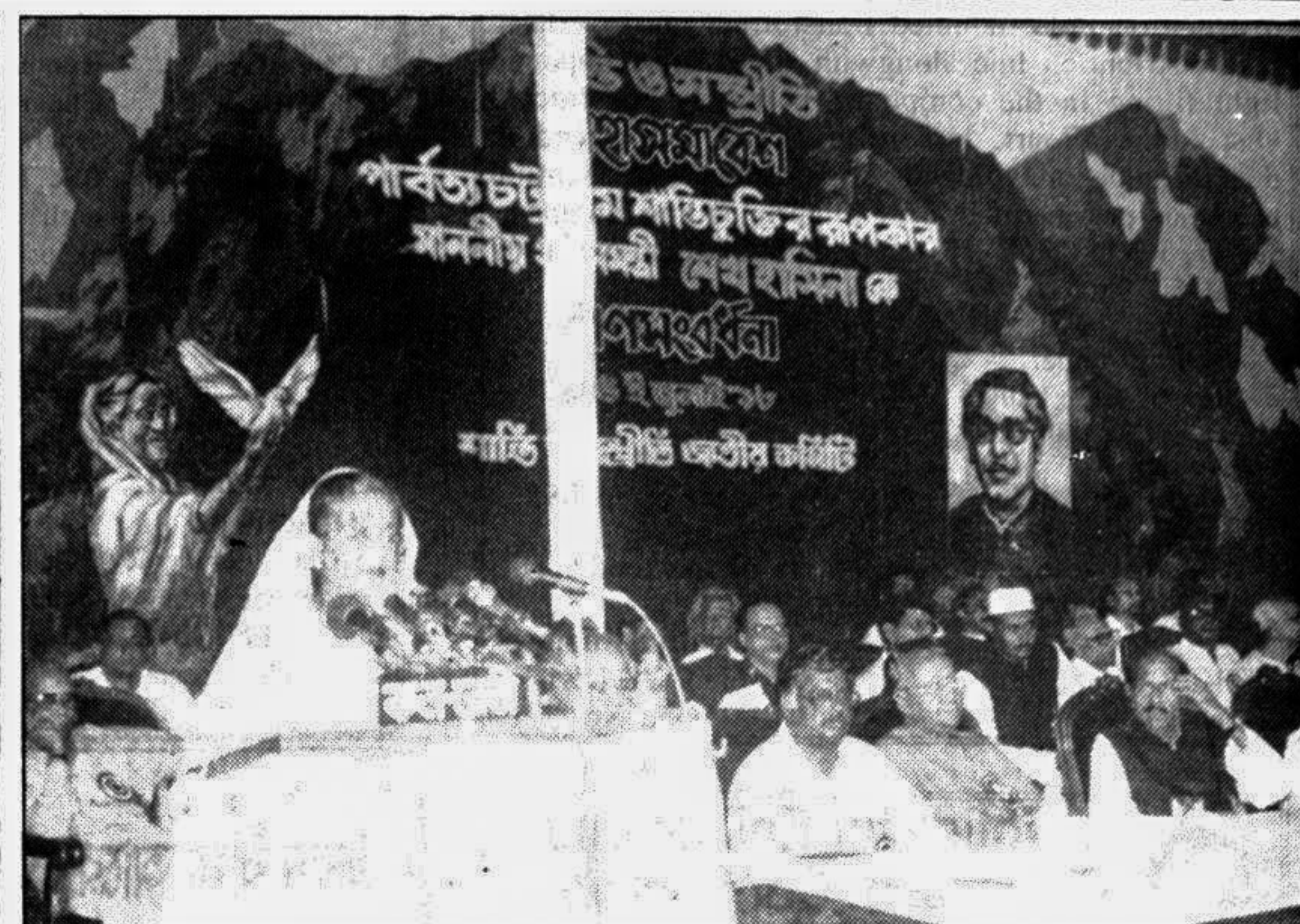
Prime Minister Sheikh Hasina speaking at a mass reception accorded to her by the National Committee for Peace and Friendship at Paltan Maidan in the city yesterday.

Besides, according to the CAB survey, prices of egg increased by 14.65 per cent, vegetables by 13.46 per cent and See Page 2