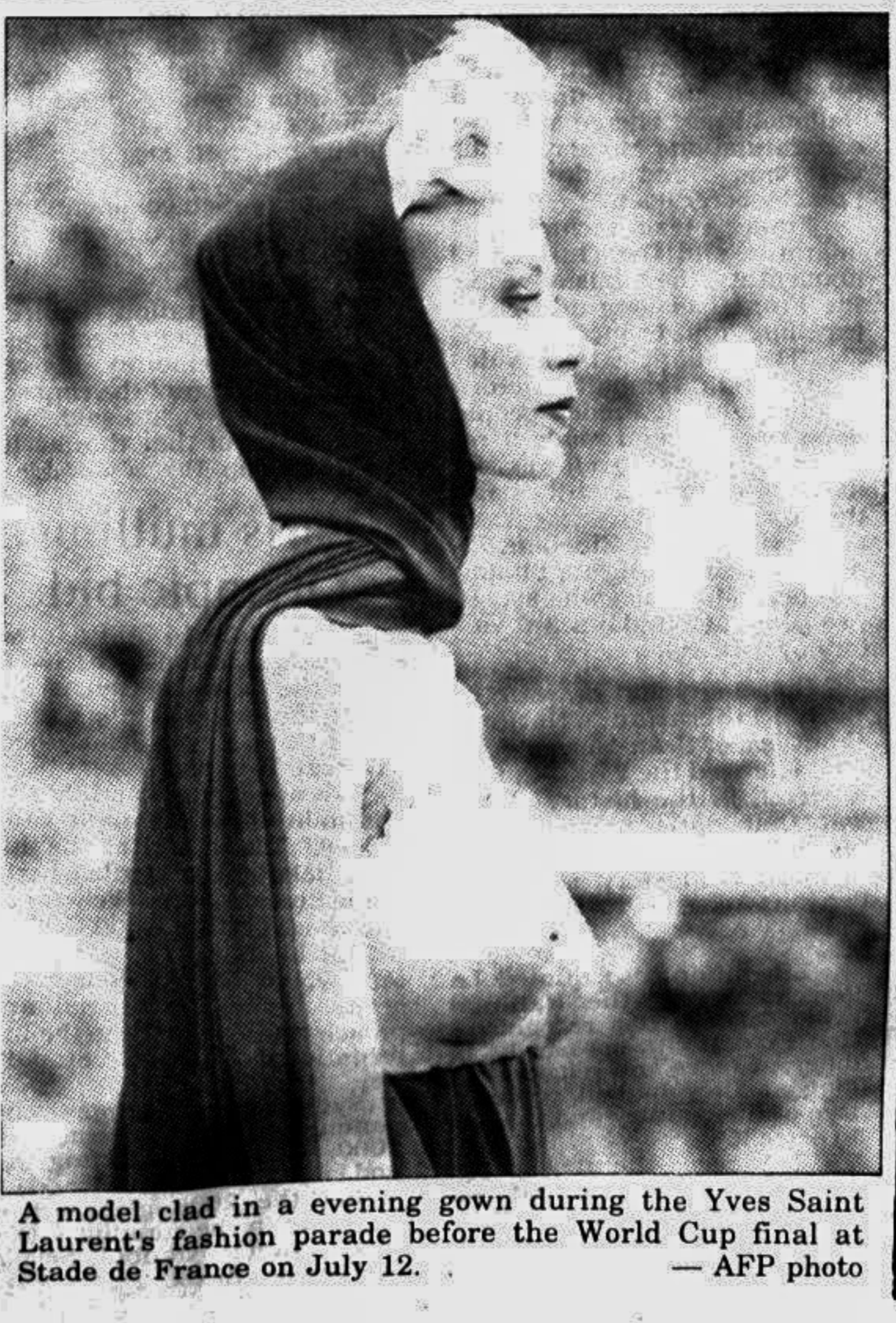
A model clad in an evening gown during the Yves Saint Laurent's fashion parade before the World Cup final at Stade de France on July 12.