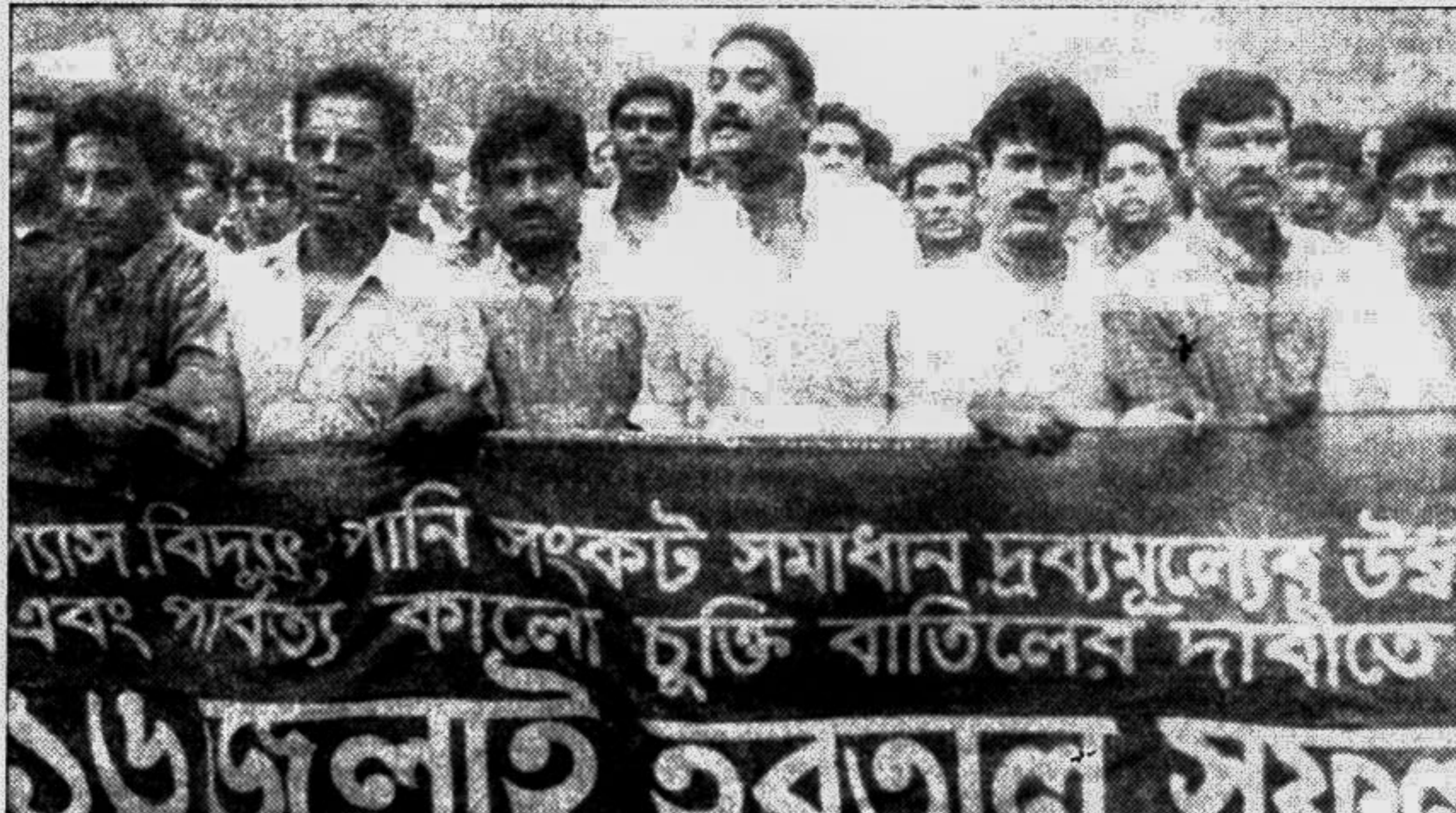
JCD brought out a procession in the city yesterday to drum up support for the July 16 hartal called by BNP.

GUWAHATI, India, July 14: Tribal separatists guerrillas killed at least eight paramilitary soldiers today in an ambush in India's mountainous northeastern state of Manipur, police said, reports Reuters.