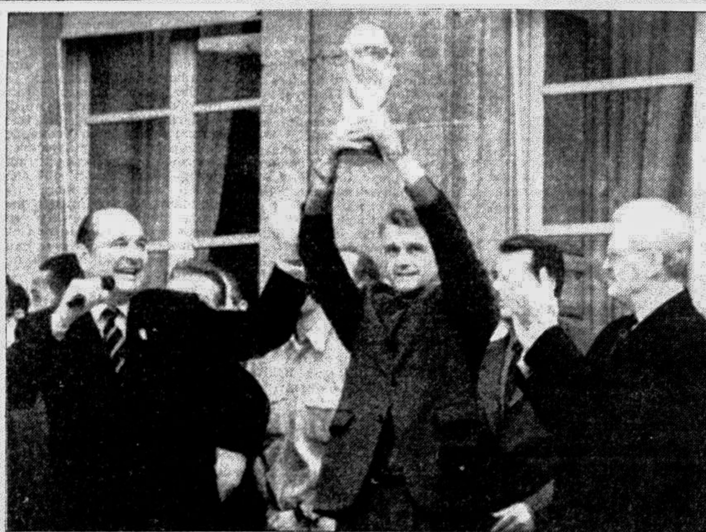
French soccer coach Aime Jacquet (center) shows the World Cup to the crowd while French President Jacques Chirac (left) and Prime Minister Lionel Jospin (right) applaud during a reception at the Elysee palace yesterday.

From Page 1 ment of arrears in wage and absence of weekly holidays, she said.