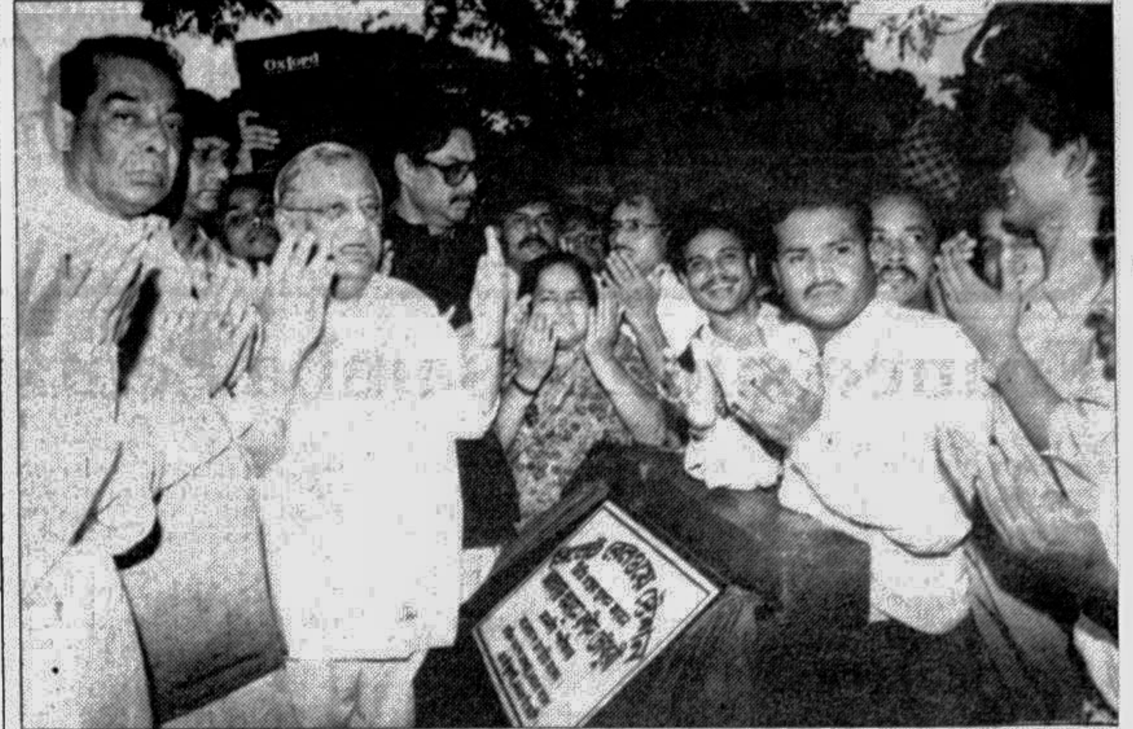
Speaker Humayun Rasheed Chowdhury, offering munajat after laying the foundation stone of a new railway station in Sylhet on Saturday.

The union parishads which received the award are: Birishairi Union of Netrakona district under Dhaka division, Haimchar Union of Chandpur district under Chittagong Division, Srirampur Union Parishad of Lalmonirhat under Rajshahi Division, Kathuli Union of Meherpur district under Khulna Division, Tobegi Union of Bhola district under Barisal and Rajhat Union Parishad of Moulvibazar district under Sylhet Division.