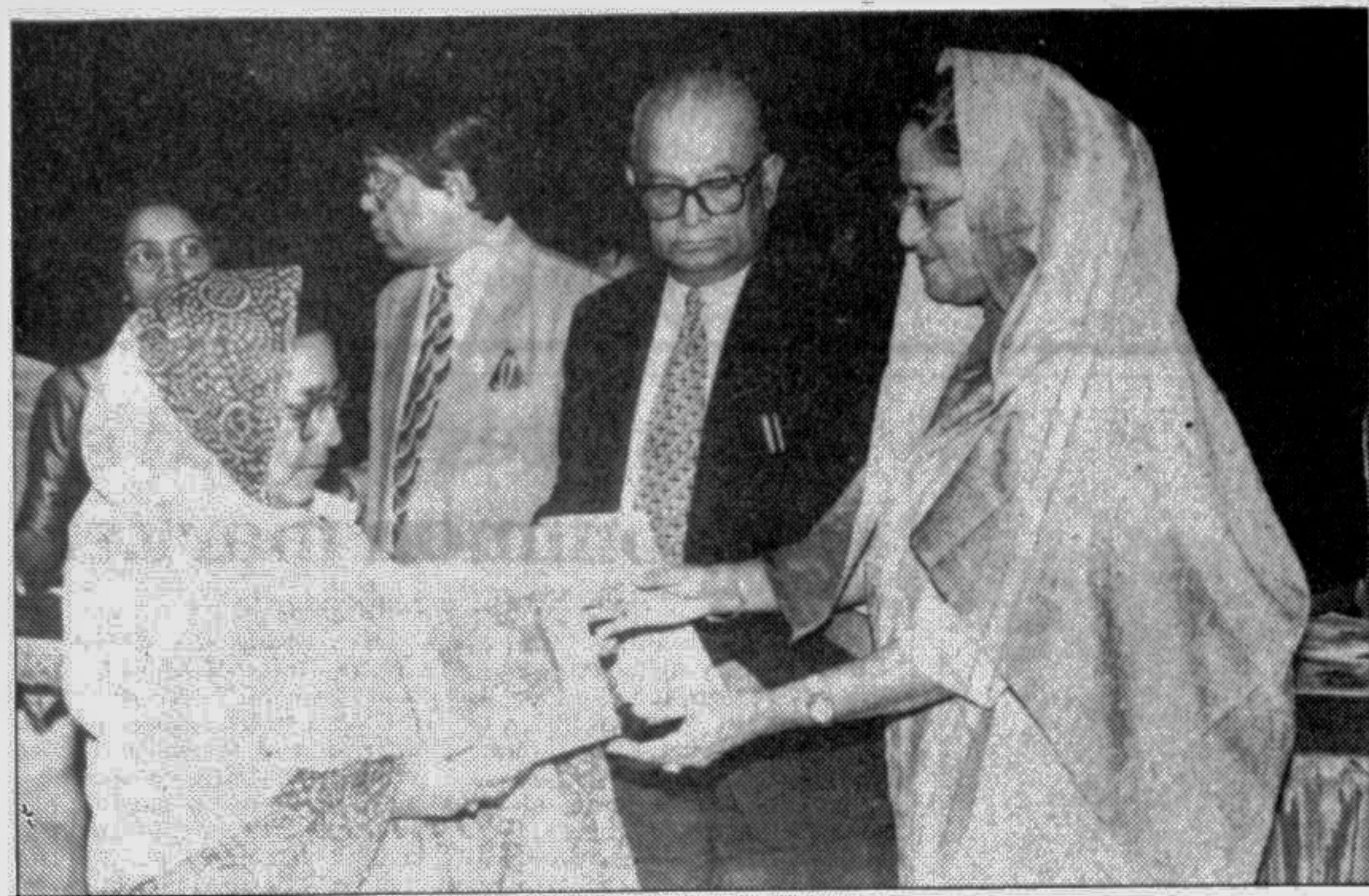
Prime Minister Sheikh Hasina distributing awards among best family welfare assistants, union parishads and field workers after the inauguration of World Population Day at the Osmany Memorial Auditorium in the city yesterday.

Prime Minister Sheikh Hasina yesterday distributed national awards among the best union parishads, family welfare assistants, non-government organisations at divisional level and mother and child-welfare centre (MCWC) at national level, for their contributions in respective fields in the city yesterday, reports BSS.