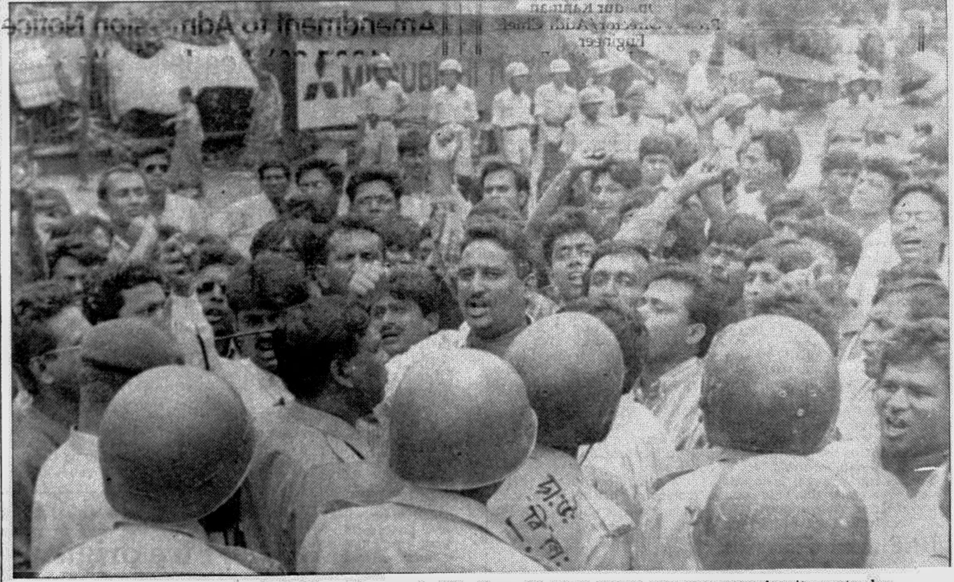
Jatiyatbadi Chhatra Dal (JCD) held a rally as part of its Home Ministry gherao programme in the city yesterday.

The Islamic scholars urged the country's ulema, imams of the mosques and the Muslim devotees to join the July 15 peace rally to further consolidate the process of peace, and the national development and progress.