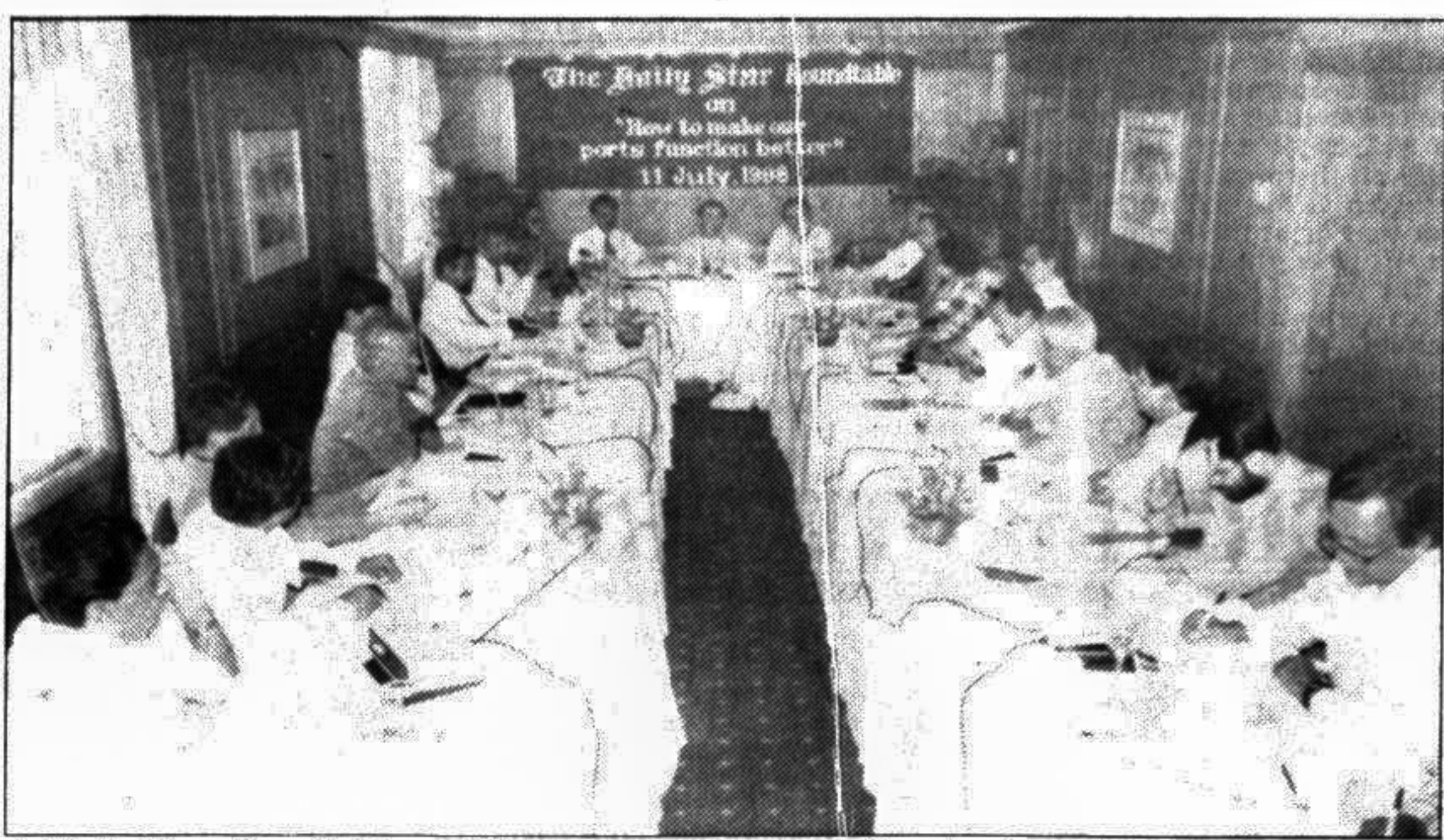
A Daily Star Roundtable on 'How to make our ports function better' was held in the city yesterday.

Some other officials of the ministry of information said the BBC is now operating an FM station under a time slot agreement with the ministry and not with the Bangladesh Betar.