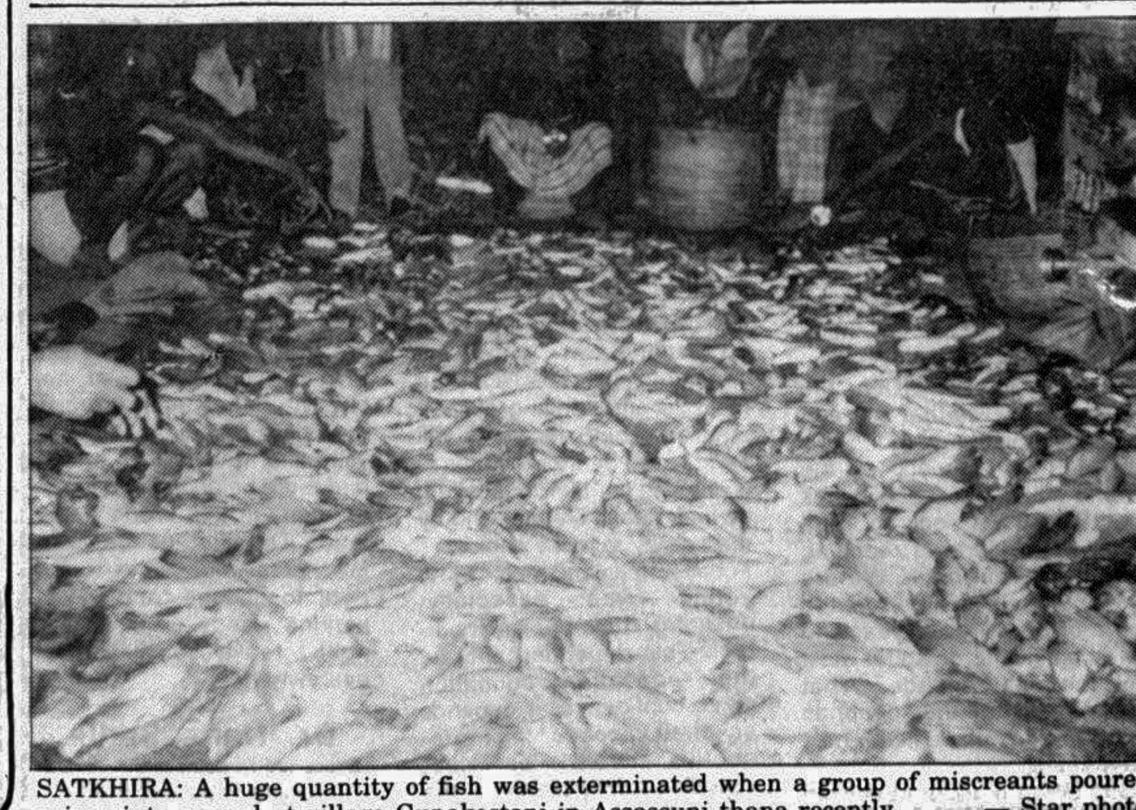
SATKHIRA: A huge quantity of fish was exterminated when a group of miscreants poured poison into a pond at village Gunakostani in Assassuni thana recently.

BAGERHAT, July 11: Four members of a family were hacked to death at village Rajair under Sarankhola thana in the district on Thursday night, reports UNB.