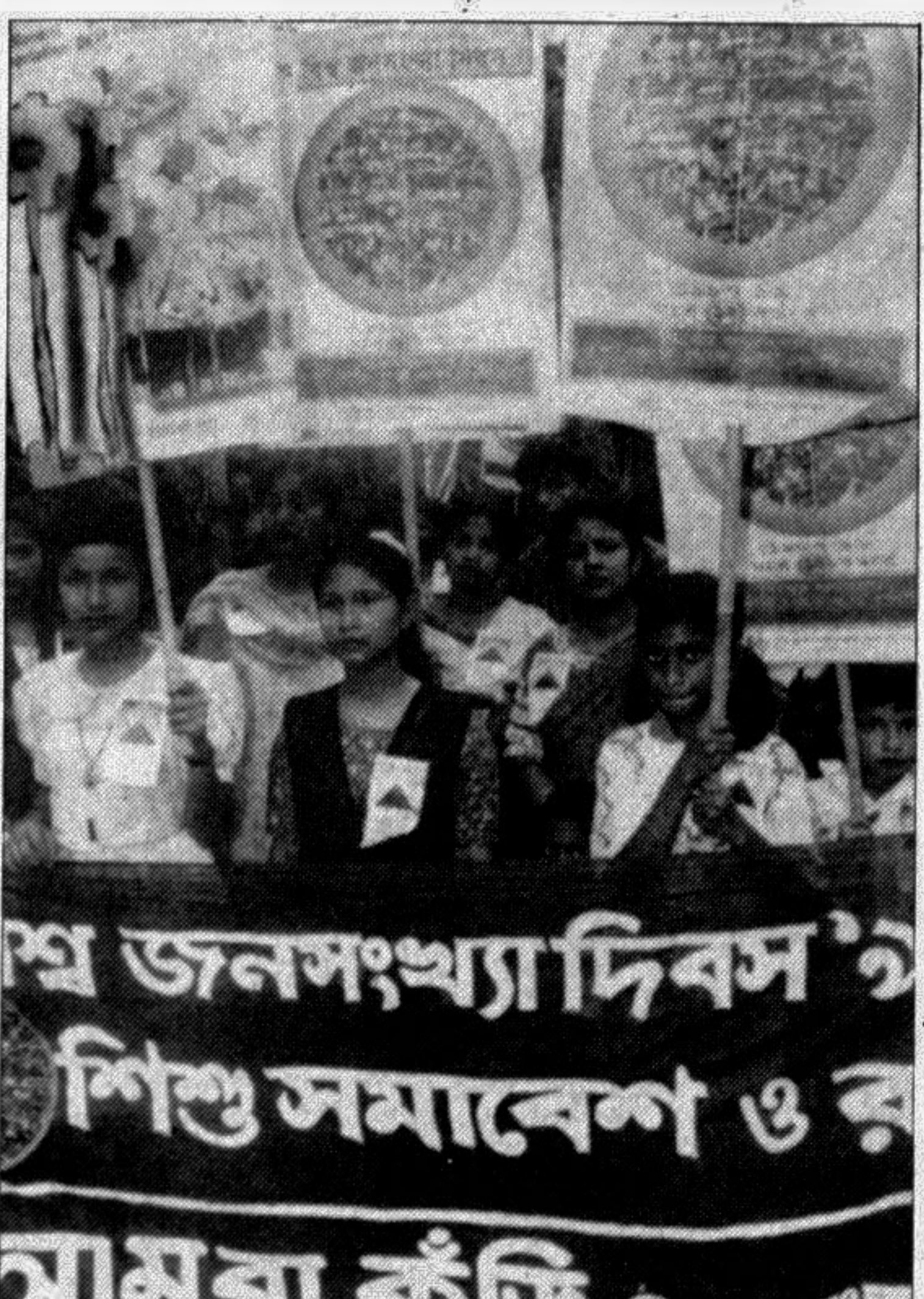
A rally was brought out on the eve of World Population Day in the city yesterday.

Lilian Thuram, who scored twice in 23 minutes in France's 2-0 win over Croatia, said the France-Brazil final was the "kind of game you dream of... It's the kind of game where you want to take pleasure from living every kick, every ball."