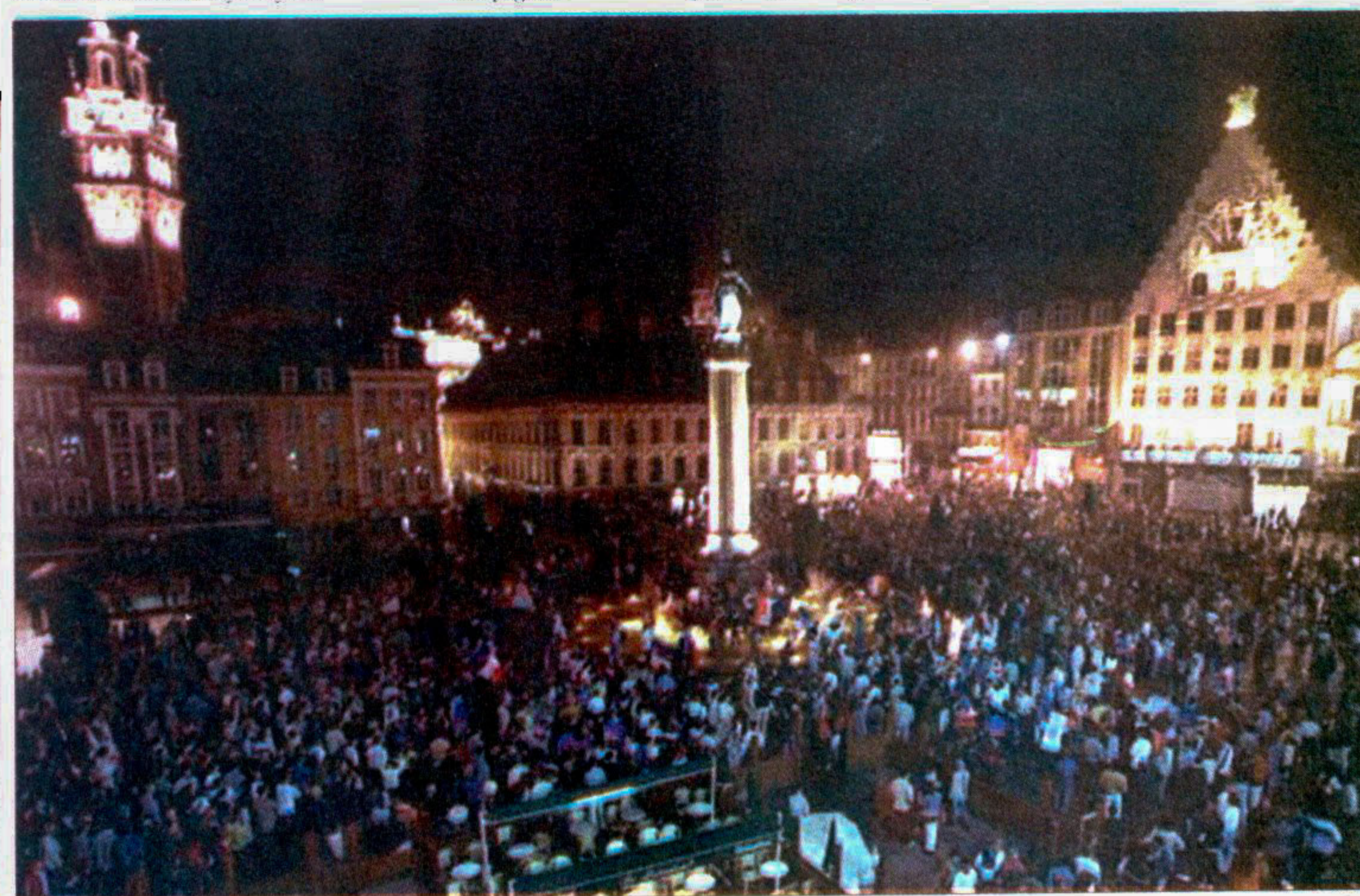
LILLE LIGHTS UP: Thousands of French supporters celebrate their semifinal victory at Lille's Grand Palace on July 8.