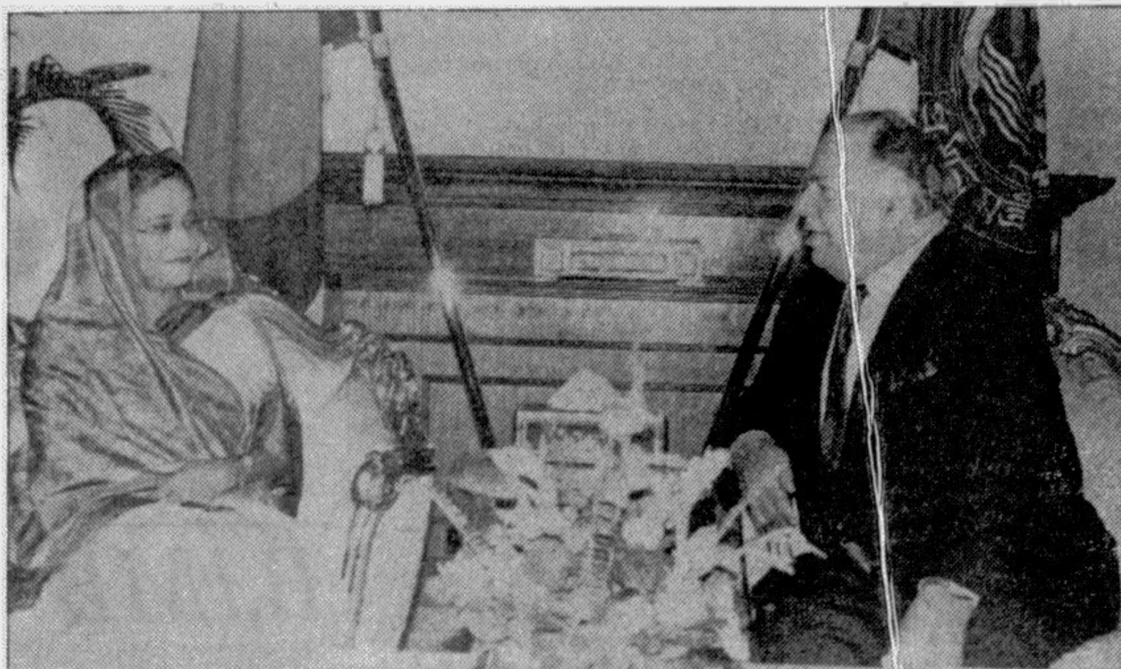
The visiting special envoy of Pakistan Prime Minister Nawaz Sharif Senator Akram Zaki called on Prime Minister Sheikh Hasina at her office yesterday.

He said that the signing of the agreement removed all impediments for anyone to visit any place in the three hill districts. He said, both tribals and non-tribals have formed committees to resist activities of the elements against the peace accord as they know that there is no alternative to peace.