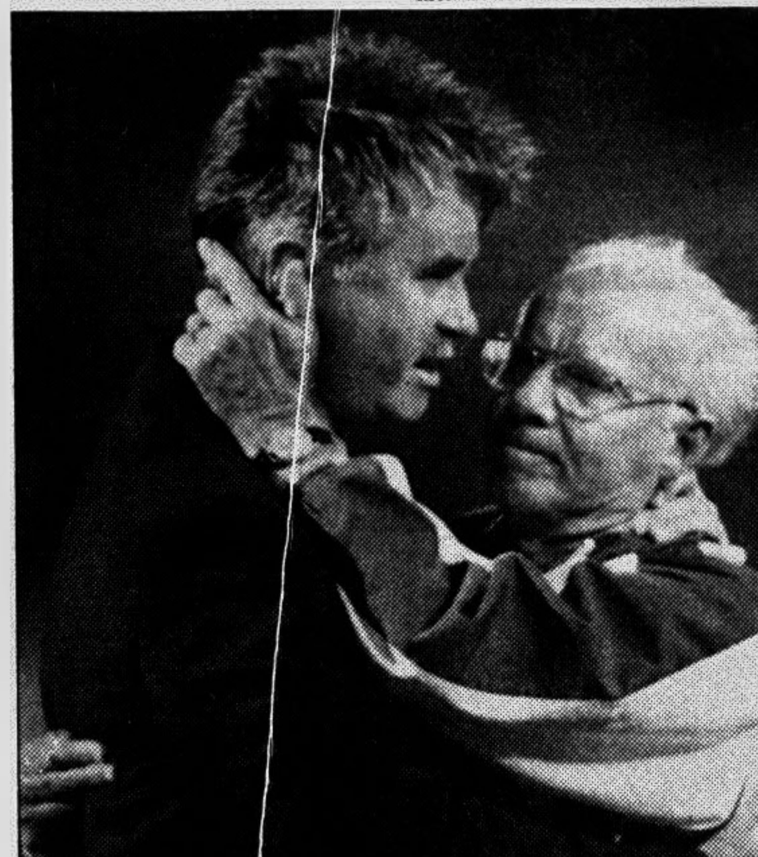
YOU WIN OLD MAN: Dutch coach Guss Hiddink (L) being embraced by his Brazilian counterpart Mario Zagallo after the semifinal on July 7.

Following their quarterfinal penalty shoot-out win over Italy, France have overtaken England with 845 points. England have 828 Norway are third with 822 and Brazil fourth on 817.