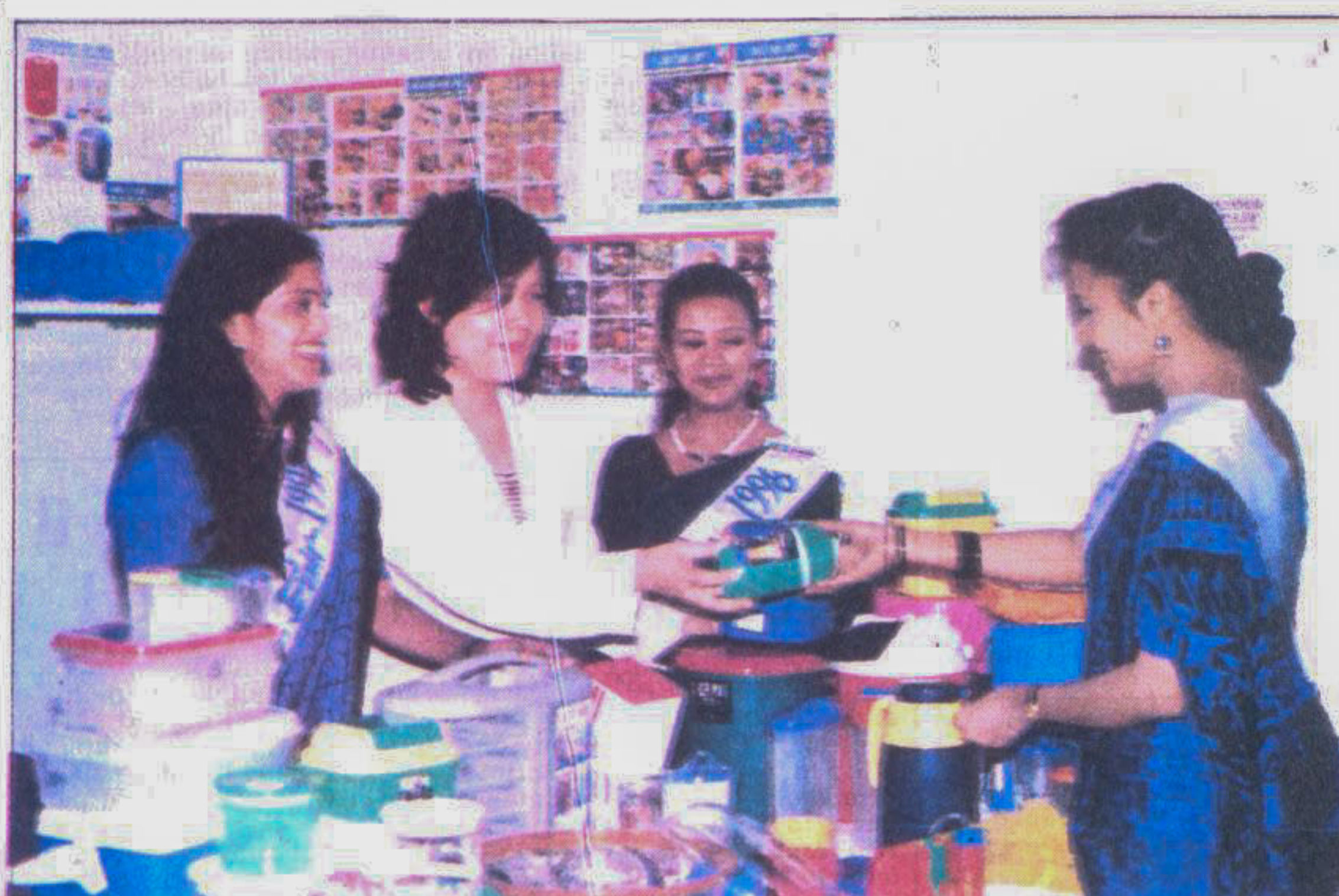
Visitors at the Thai Trade Fair that began at Dhaka Sheraton Hotel yesterday.