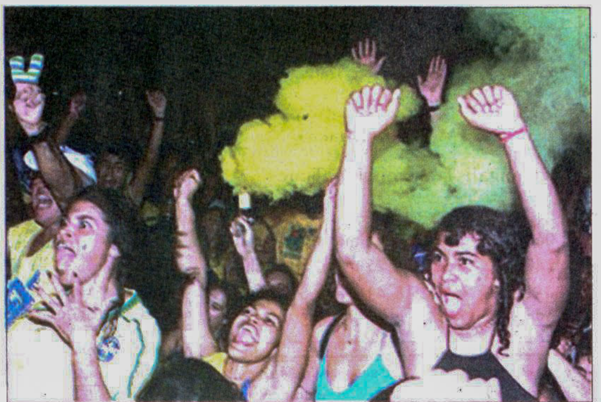
Brazilian soccer fans in Rio de Janeiro celebrate yesterday after Brazil defeated the Netherlands 4-2 in a penalty shoot-out during the semi-final of the World Cup.

That's why the match went to penalties," he said. Goalkeeper Taffarel, who saved two spot kicks, said: "That was God helping me. I am very happy to have contributed to this victory. It was a really tough game but Brazil can be proud of its team. Brazil is ready for the final." Dutch coach Guus Hiddink, who had fielded a team without injured Winston Bogarde and Marc Overmars or the suspended Arthur Numan, congratulated the Brazilians on their victory. "I'm pleased with the performance of my team." "It was a victory for the team. We're here to represent Brazil and we're here to win. This is our objective. We have willpower, flair and tactics. Every player contributed to this wonderful victory," he added. "We are alternating between joy and tension and we are only going to celebrate at the final." "Everything was good about this performance. Brazil were good physically and good tactically," he added. Following 130 minutes play the sides were locked at 1-1 after extra time. "We played on instinct in ex-