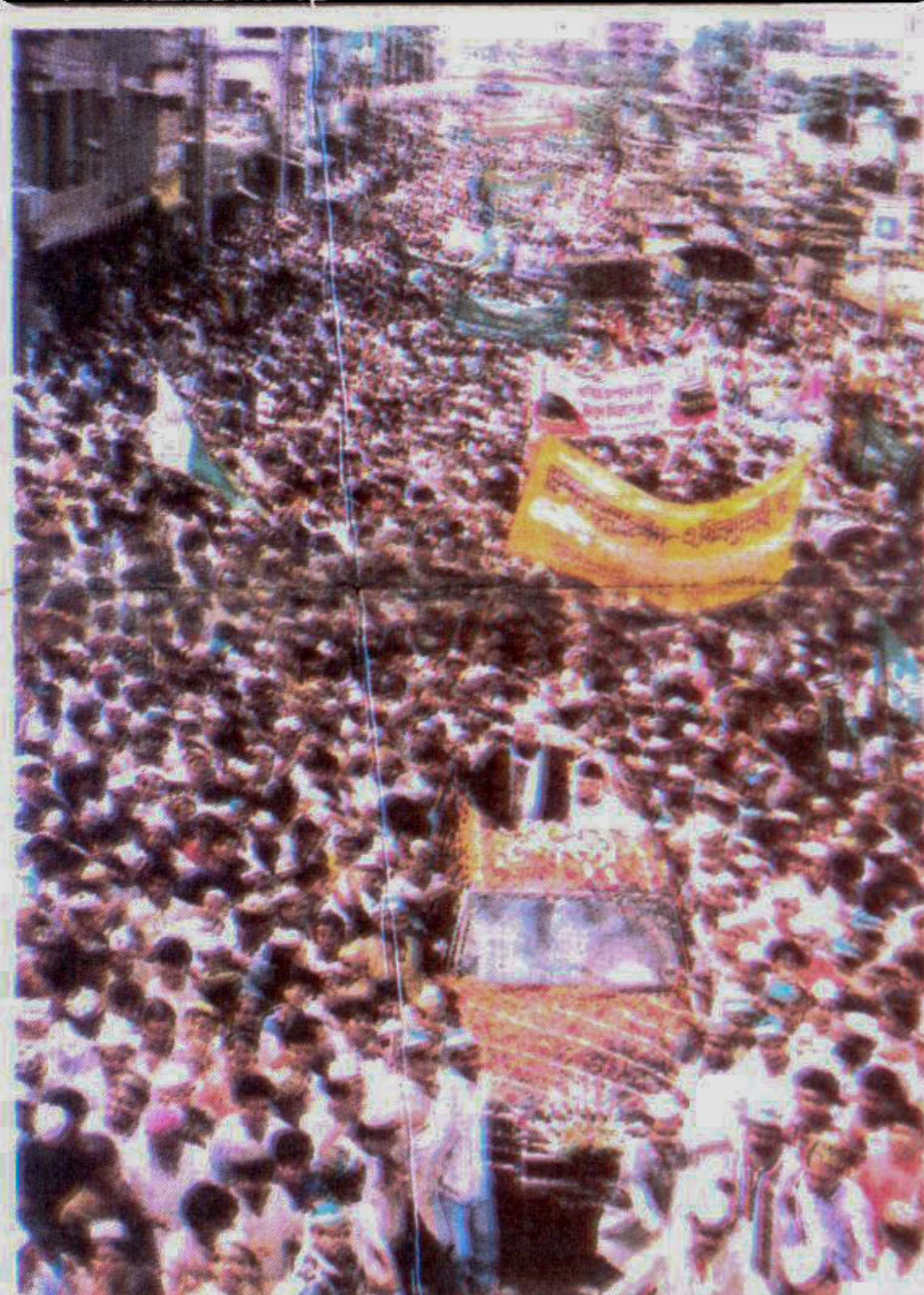
A colourful procession was brought out at Narayanganj on Tuesday in observance of Miladunnabi.