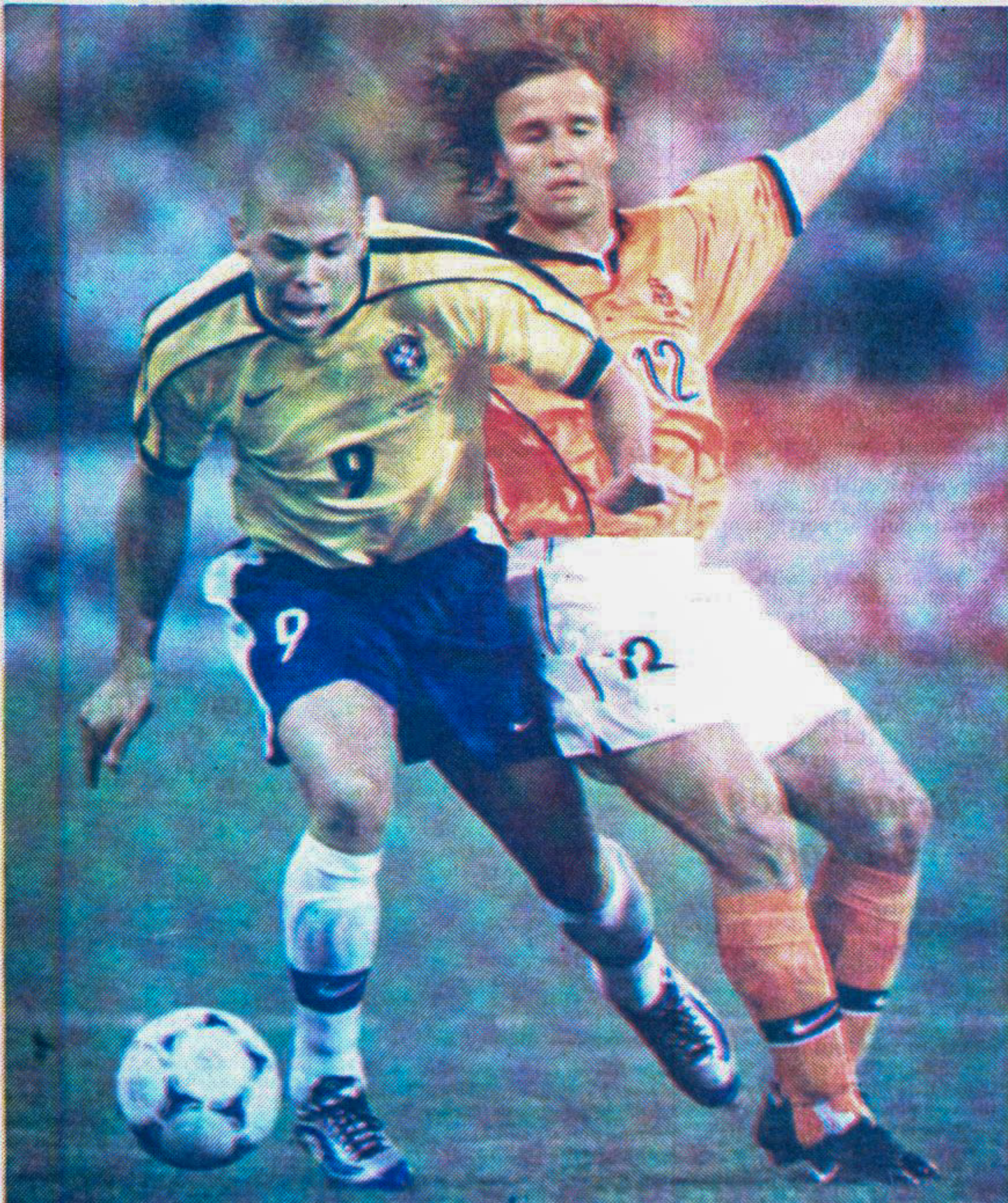
UNDOUBTEDLY THE BEST: Superstar Ronaldo (L) outfoxes Holland's Boudewijn Zenden during yesterday's semifinal at Marseille.

The world player-of-the-year had seized on a through ball from Rivaldo and showed great strength and balance to