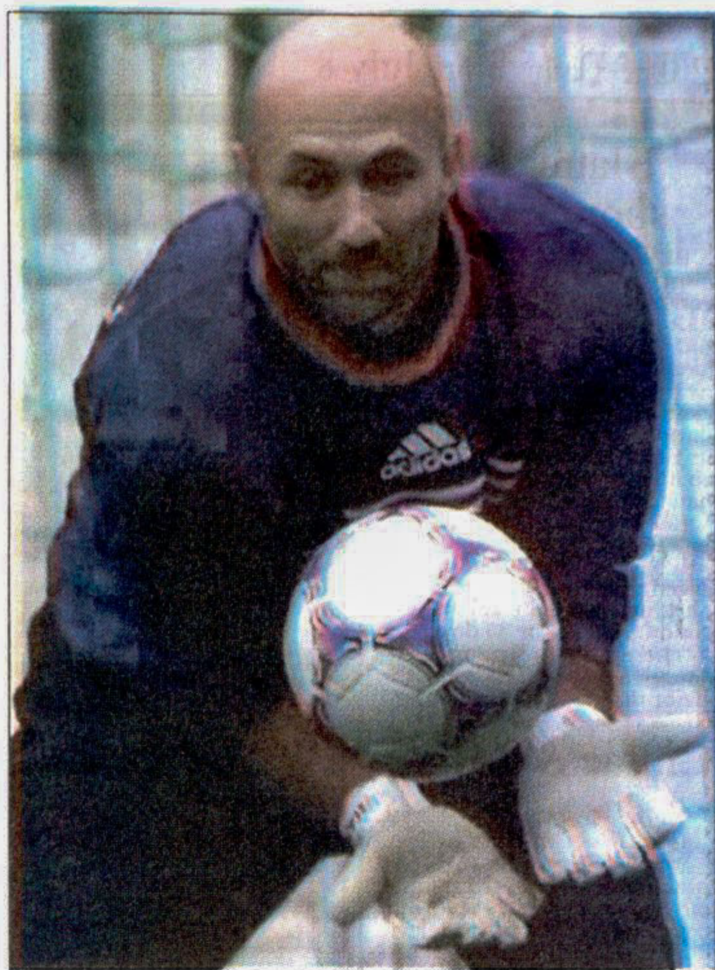
Fabien Barthez, the French custodian, practicing at Clairefontaine.