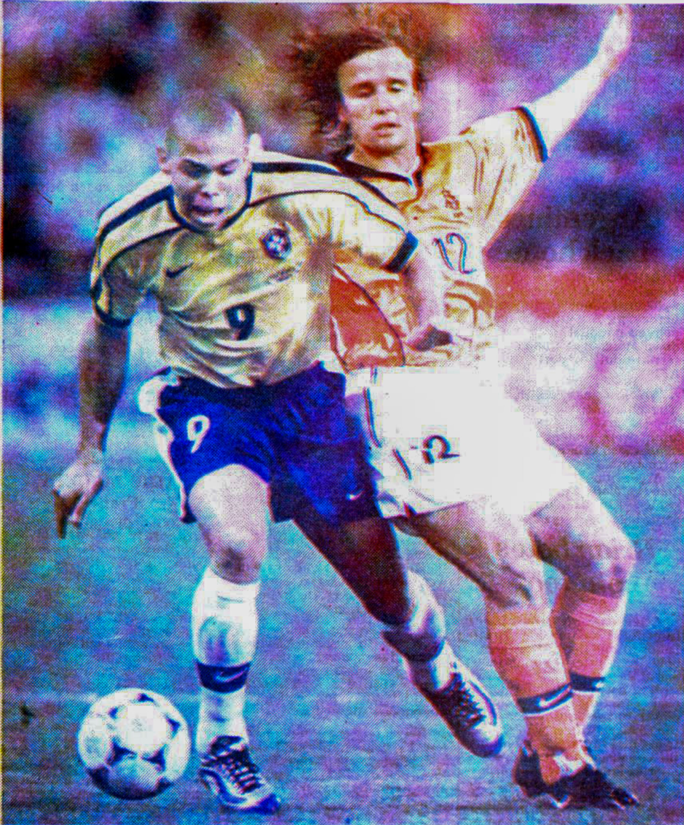
UNDOUBTEDLY THE BEST: Superstar Ronaldo (L) outfoxes Holland's Boudewijn Zenden during yesterday's semifinal at Marseille.

The world player-of-the-year had seized on a through ball from Rivaldo and showed great strength and balance to