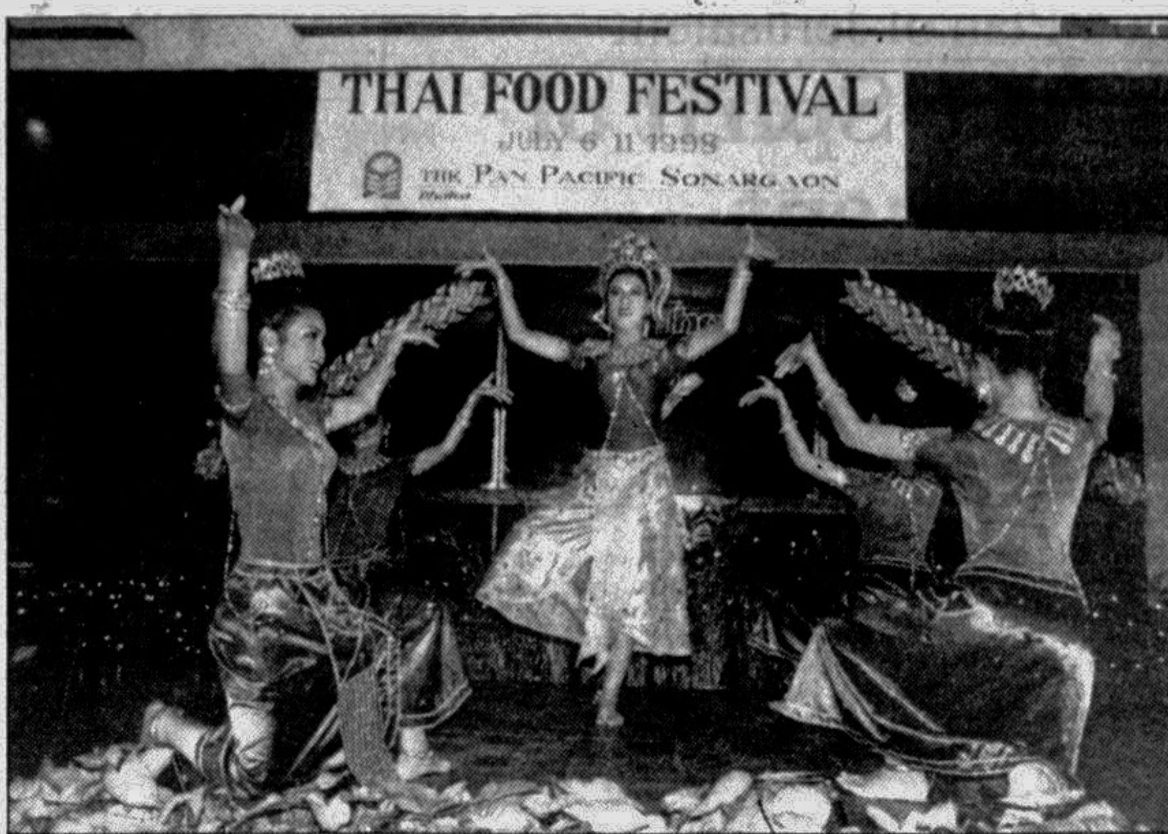
A group of six Thai dancers flown in by Thai Airways presented live dance at Sonargaon Hotel's Cafe Bazar yesterday marking the start of a week-long 'THAI FOOD FESTIVAL'. Ambassador of Thailand Pithaya Pookaman inaugurated the festival.

Later, Moulana Nurul Islam led a munajat seeking divine blessings for continued peace, progress and prosperity of the nation.