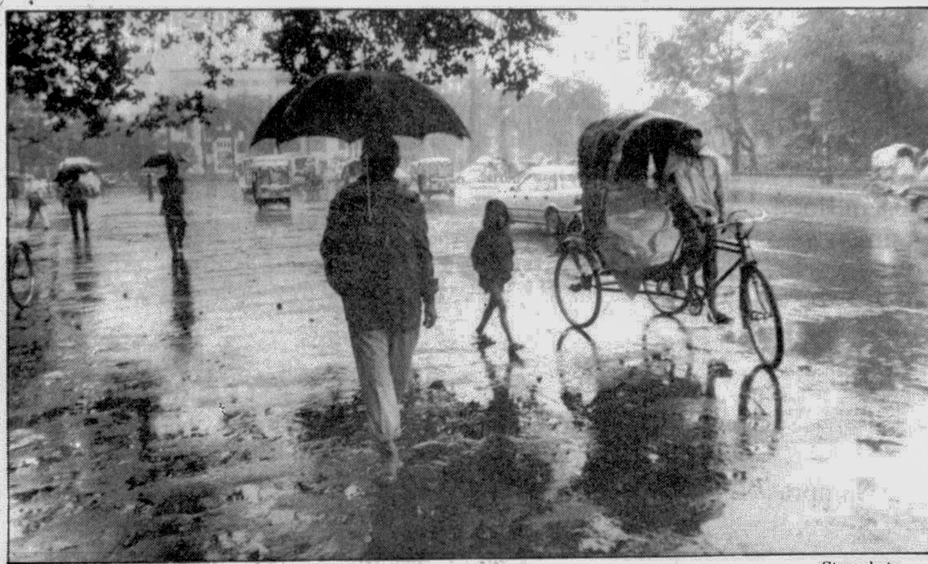
The city experienced drizzles throughout the day yesterday.

Called by Maolana Mahbub-e-Khoda Deoanbagi Hazur Kebla, the conference is expected to be participated by millions of sufies and devotees from across the country, the release added.