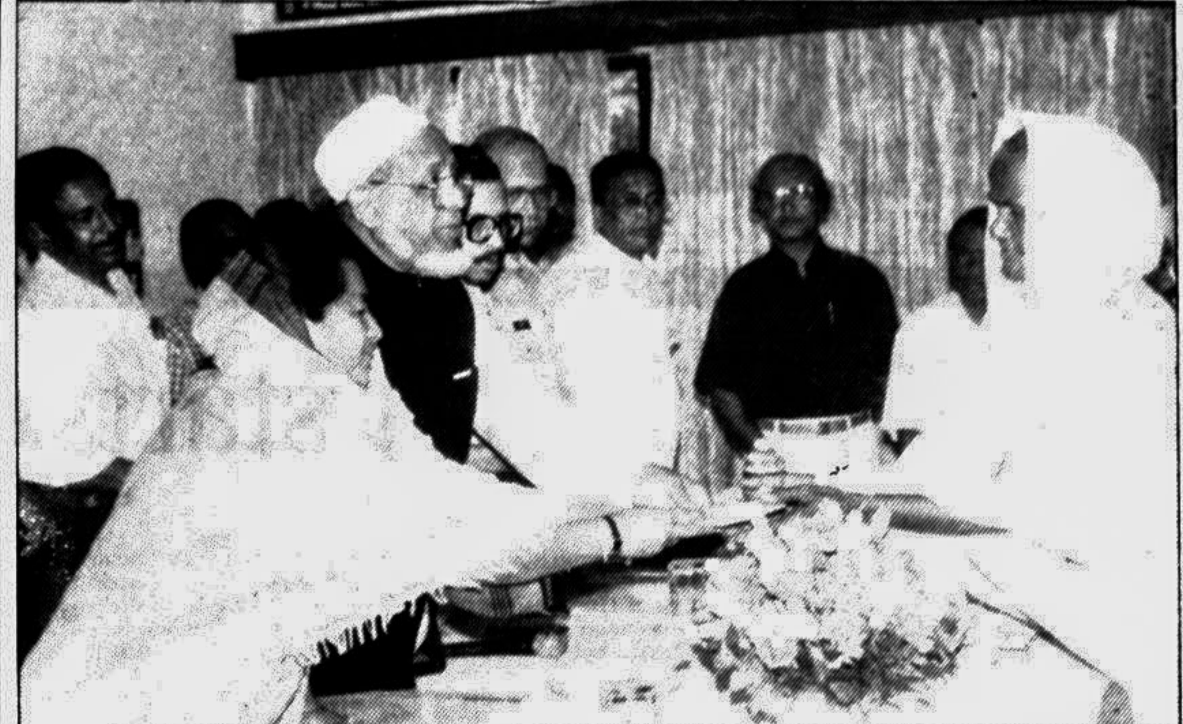
SYLHET: Foreign Minister Alhaj Abdus Samad Azad handing over cheques of allowance for elderly people at a function held at the Deputy Commissioner's office on Sunday. Syeda Zebunnessa Haque MP, was also present.

Some 15,000 youths and another 15,000 adult people would also be brought under the literacy programme. A number of NGOs will be involved in the implementation of various programmes of the project, it is learnt.