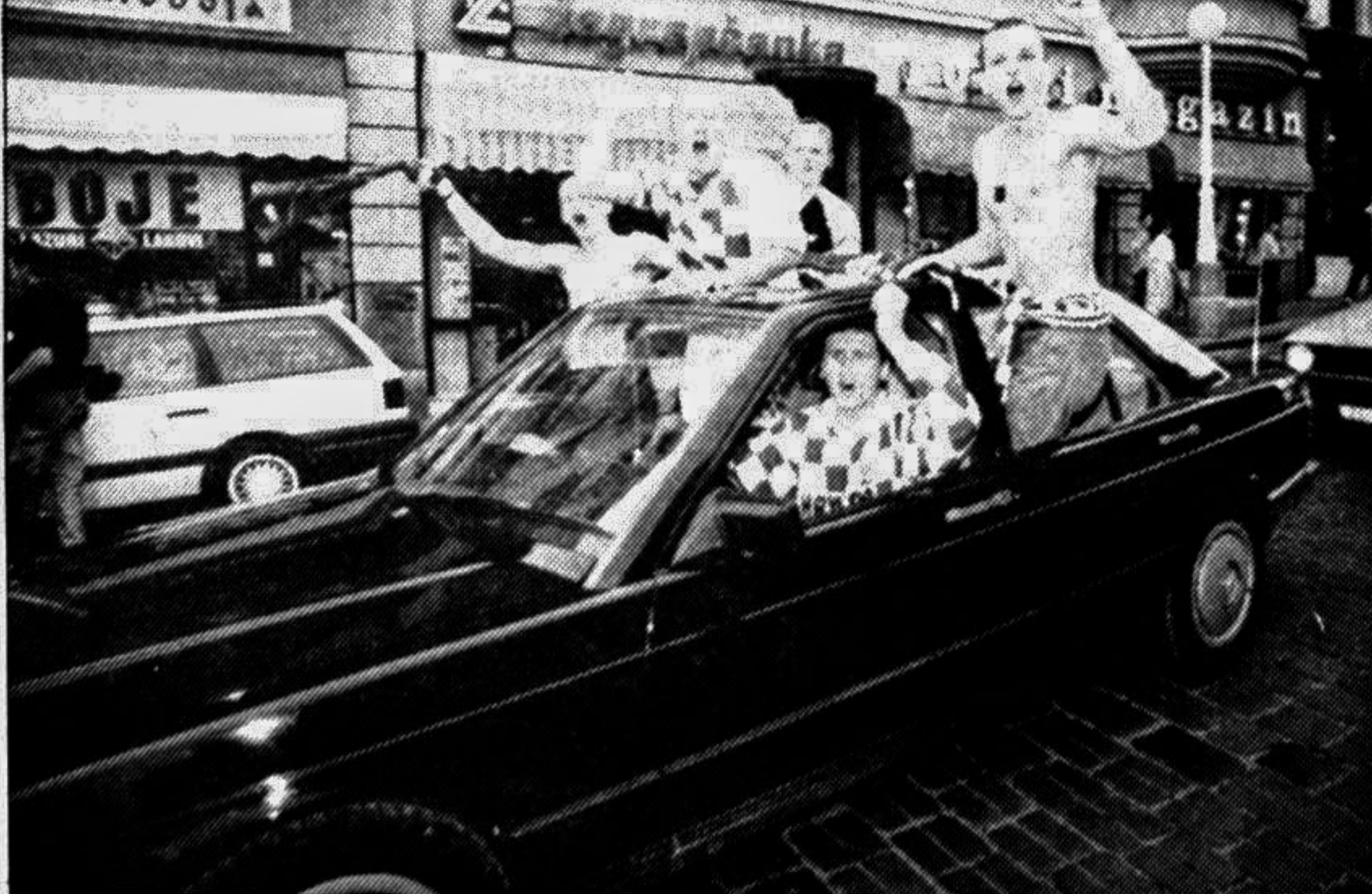
HERE COMES CROATIA: Jubilant Croatian fans take to the streets at capital Zagreb after the second round victory over Romania on June 30.

The five Juventus men in Italy's team meanwhile know all there is to know about France's most feared weapon, playmaker Zinedine Zidane.