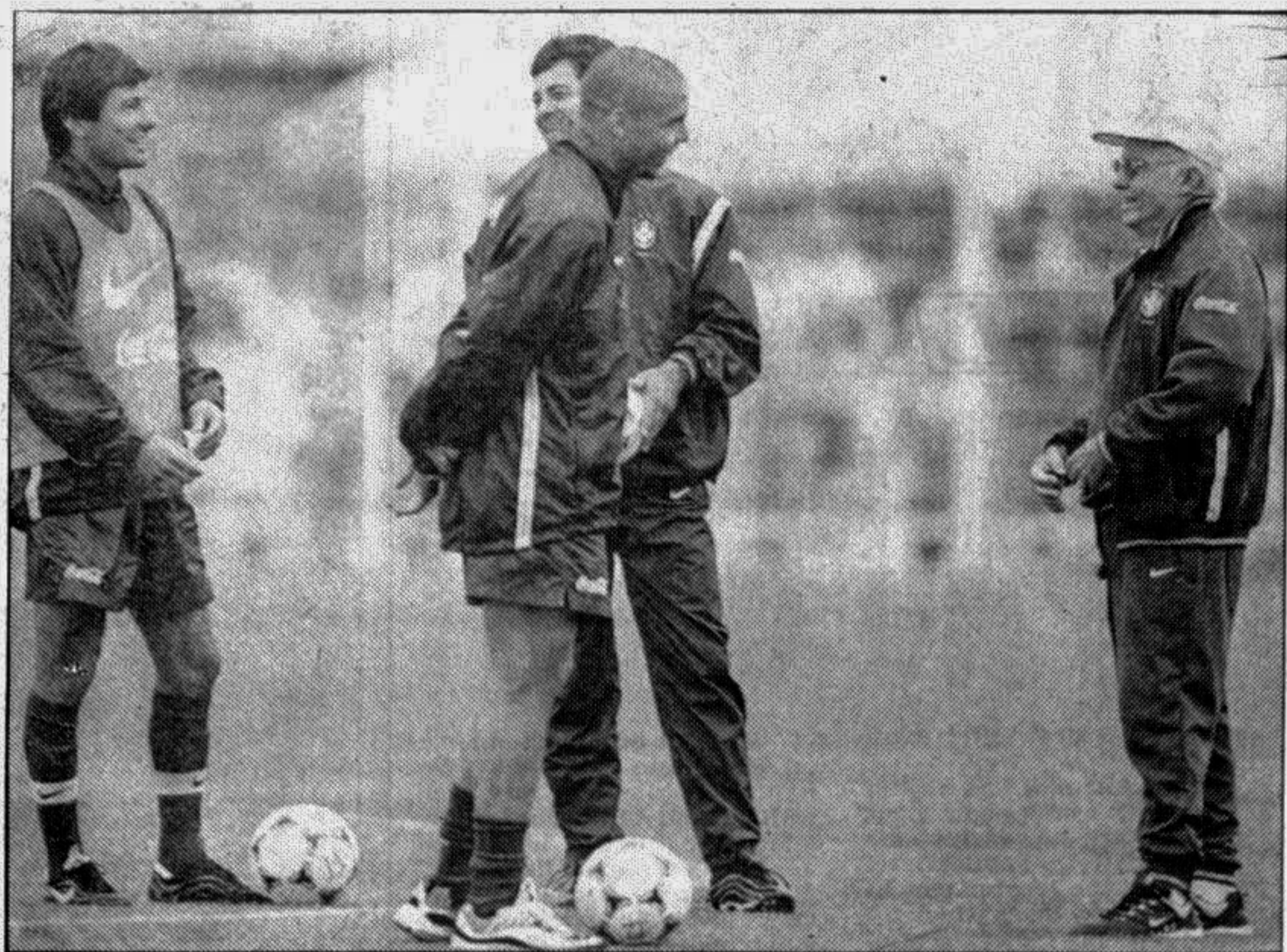
THINGS LOOK FINE: Leonardo (L), Ronaldo (C) and Brazil coach Mario Zagallo in a cheerful mood during practice at Ozoir la Ferriere on June 30.

From page 16 The surge at half-time was equivalent to that reached in 1985 during an episode of 'Dallas' when JR was shot.