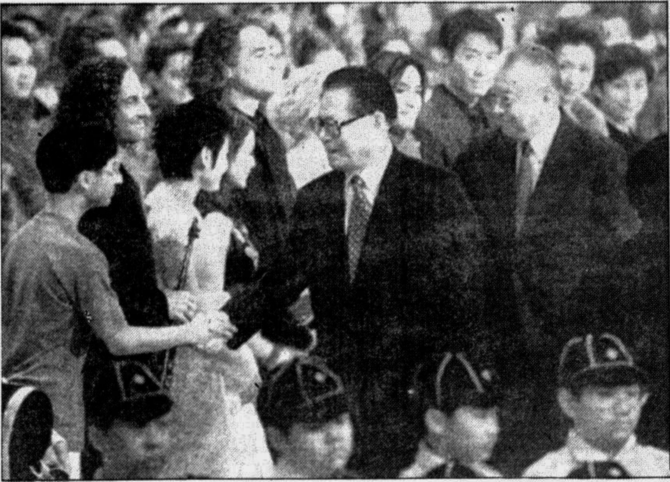
Chinese President Jiang Zemin, followed by Hong Kong leader Tung Chee-Hwa, shaking hands with performers at the end of a performance celebrating the first anniversary of Hong Kong's return to Chinese rule, held in Hong Kong yesterday.

From Page 1 this, a loan will be classified within three months of becoming overdue. The committee said this definition of defaulted loans would clear all confusion in this regard. The committee also said the BB should issue specific circular on restricting fresh loan facilities to a defaulting company or any related company. The circular should clearly spell out the definition of 'loan facilities' and 'organisation related to the interest of a defaulting company'. It said all kinds of 'funded and non-funded' financial facilities should be included in the 'loan facilities' term. The committee also spelled out that any person or organisation controlling a defaulting company through ownership, partnership or directorship will be considered as an organisation related to the interest of a defaulting company. The person, in this case, will also include the members of his/her family, like husband, wife, parents and dependent children.