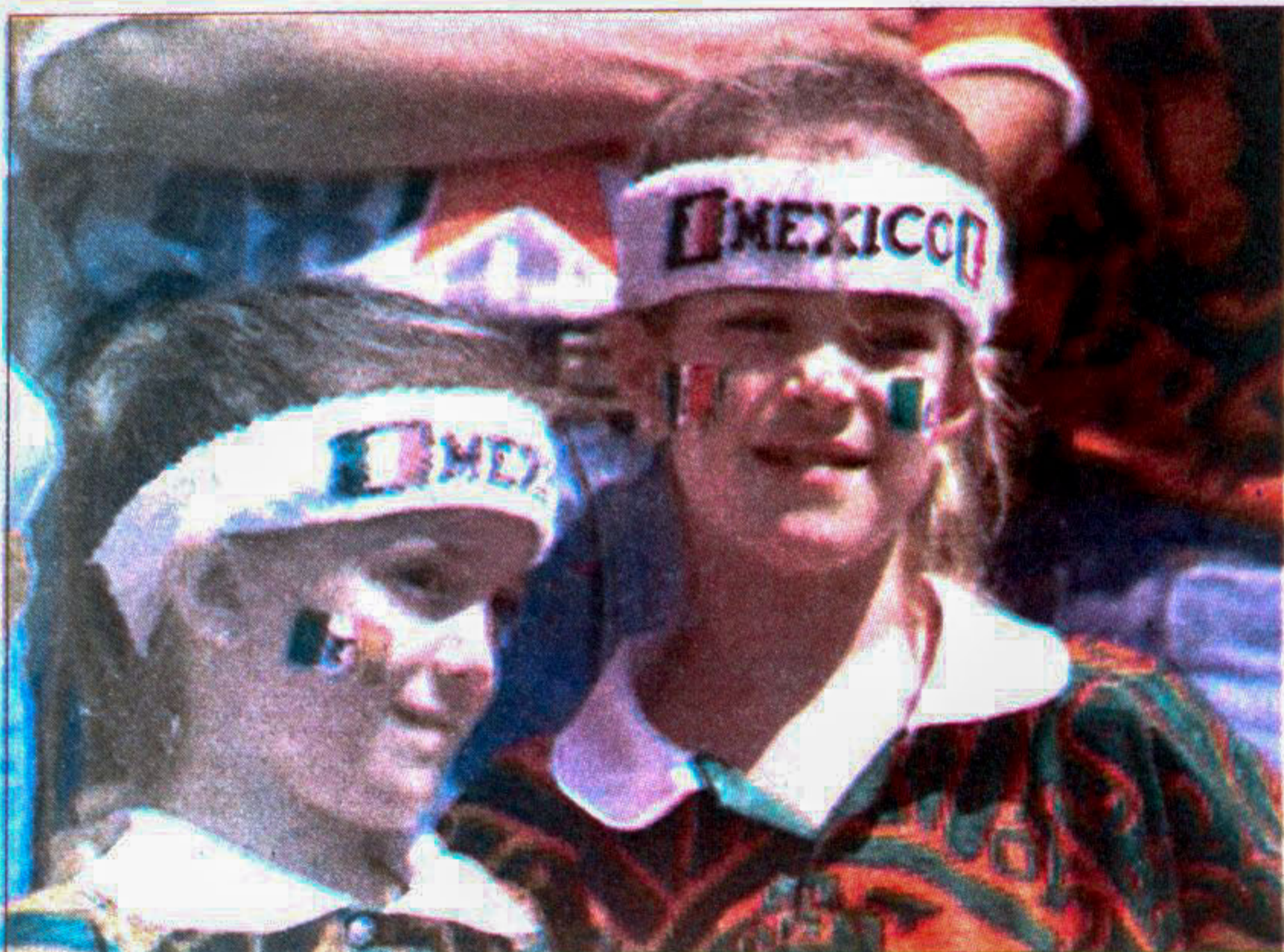
MEXICAN BAMBINOS: Two little Mexican fans waits for the second round game against Germany to start at Stade de la Mosson in Montpellier on June 29.