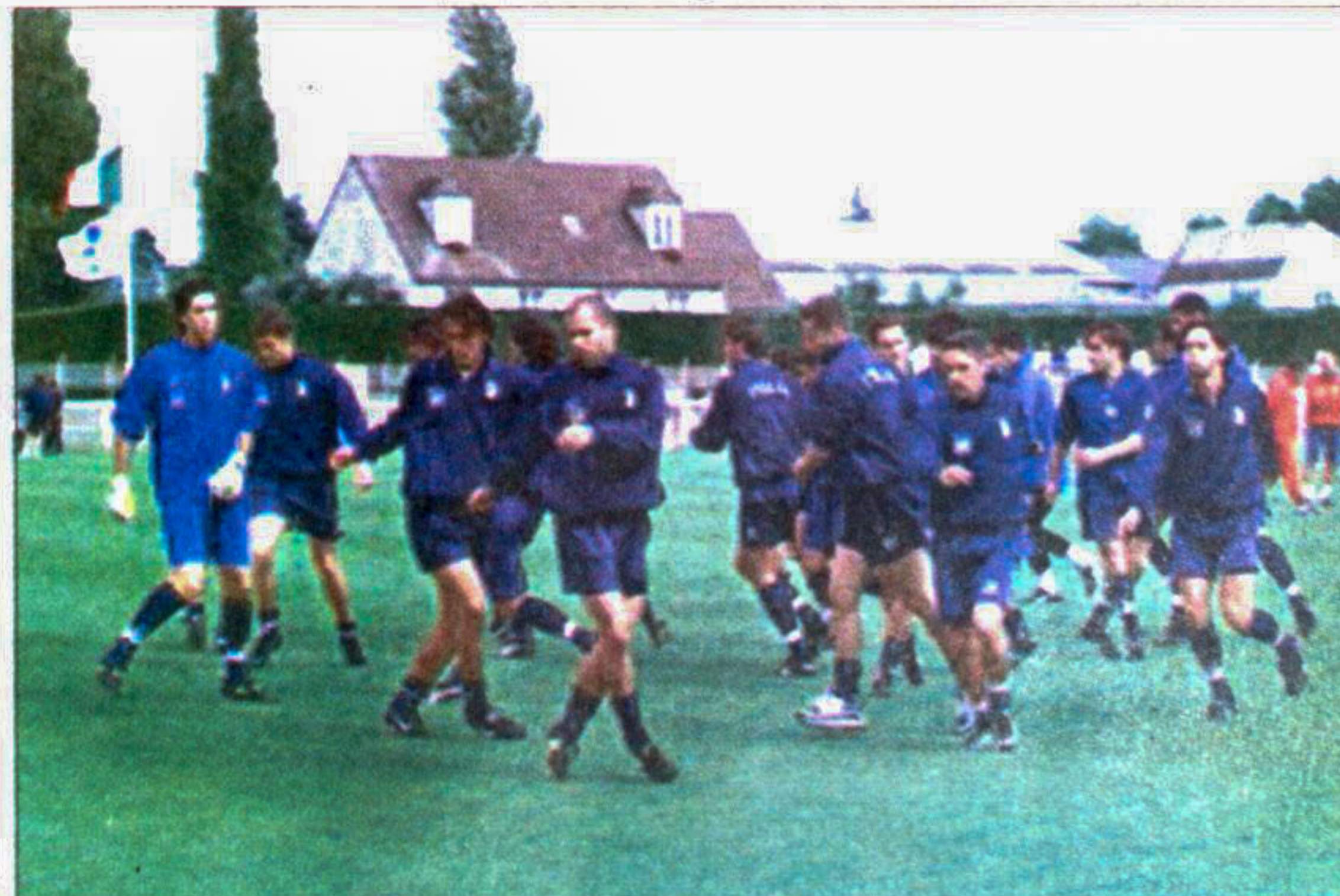
The Italian squad limber-up at their Senlise base on June 29.

think the French will be worn out by their marathon win over the South Americans. "We've got very good players, but we don't have a player like Djorkaeff," he admitted. "Someone who moves a great deal between attack and defence, someone who can take people on and beat them, and then come back to cover." "France used up a lot of energy to beat Paraguay, but the motivation and the strength soon comes back. I heard what Zidane and Deschamps have been saying and they sounded optimistic." Despite the brickbats which Maldini has suffered over the past week, the Italy coach is convinced there will be plenty of entertaining football ahead. "The best matches are still to come in this tournament," he said. "But we have to give everything we have. Looking back over our campaign, I think we've played very well so far." "We were criticised a bit more than we should have been against Norway, but I still think it was a good game and that we did what we had to do."