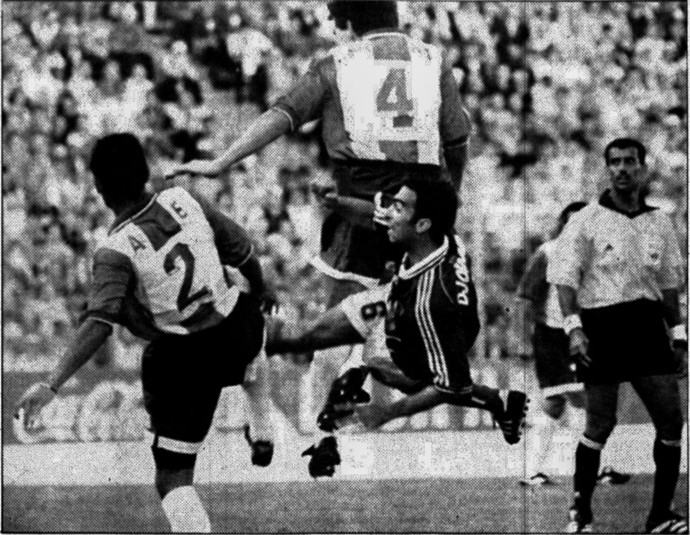
Youri Djorkaeff (C) of France executes an acrobatic side volley during the second round match with Paraguay on June 28.