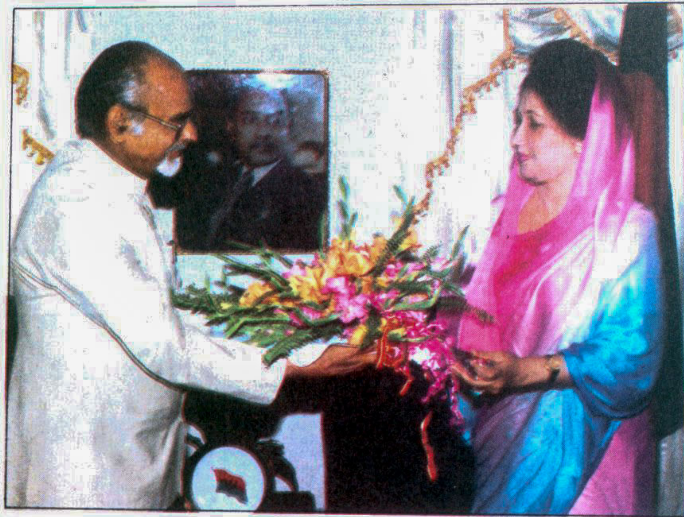
BNP chairperson and Leader of the Opposition in Jatiya Sangsad Begum Khaleda Zia receiving former Indian Prime Minister IK Gujral when he called on her at her official residence in the city yesterday.