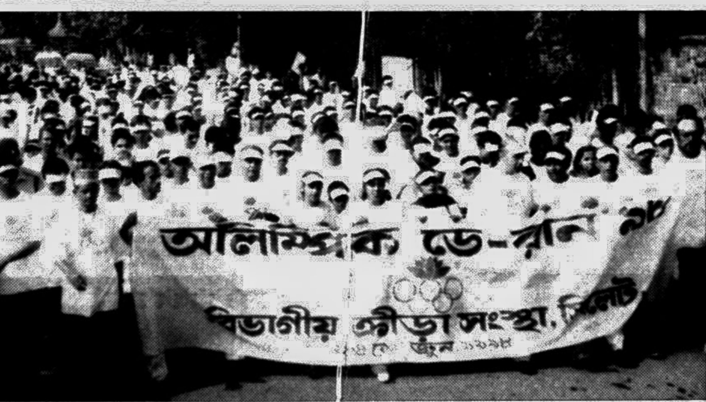
SYLHET: The divisional sports association organised Olympic Day Run here on Friday.

Once the local people decided to face the terrorists jointly with a view to getting rid of the terrorist activities of Sarbahara men.