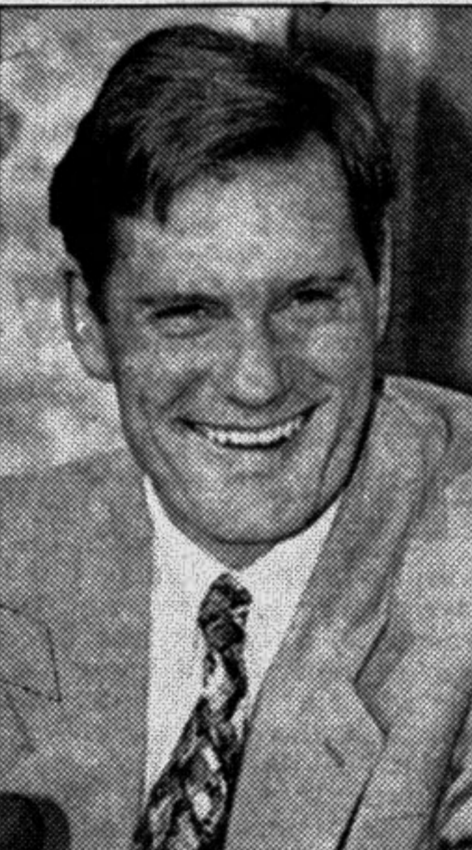
Glenn Hoddle (England soccer manager) 'If we had taken our chances we would have won by 1-0 or 2-0. After his side beat Colombia 2-0.

Office hockey Blue Berry Travels registered a facile 7-0 victory over Bangladesh Air Force in the Shah Sports Office hockey league at the Hockey Stadium yesterday, reports UNB. The first half score was 4-0.