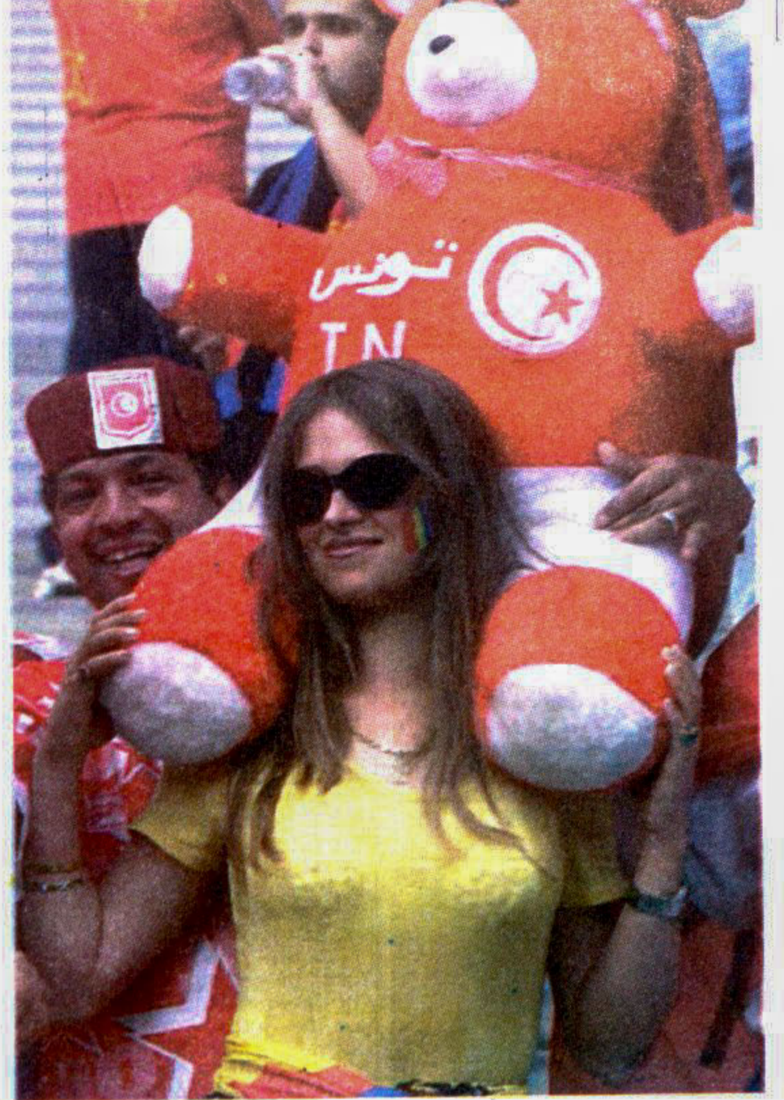
A Romanian fan carrying a Tunisian teddy bear puppet, enjoys herself at Saint-Denis.

Now England have the chance to gain revenge for the "Hand of God" goal in Mexico in 1986 when Diego Maradona admitted he knocked their first goal in with his hand.