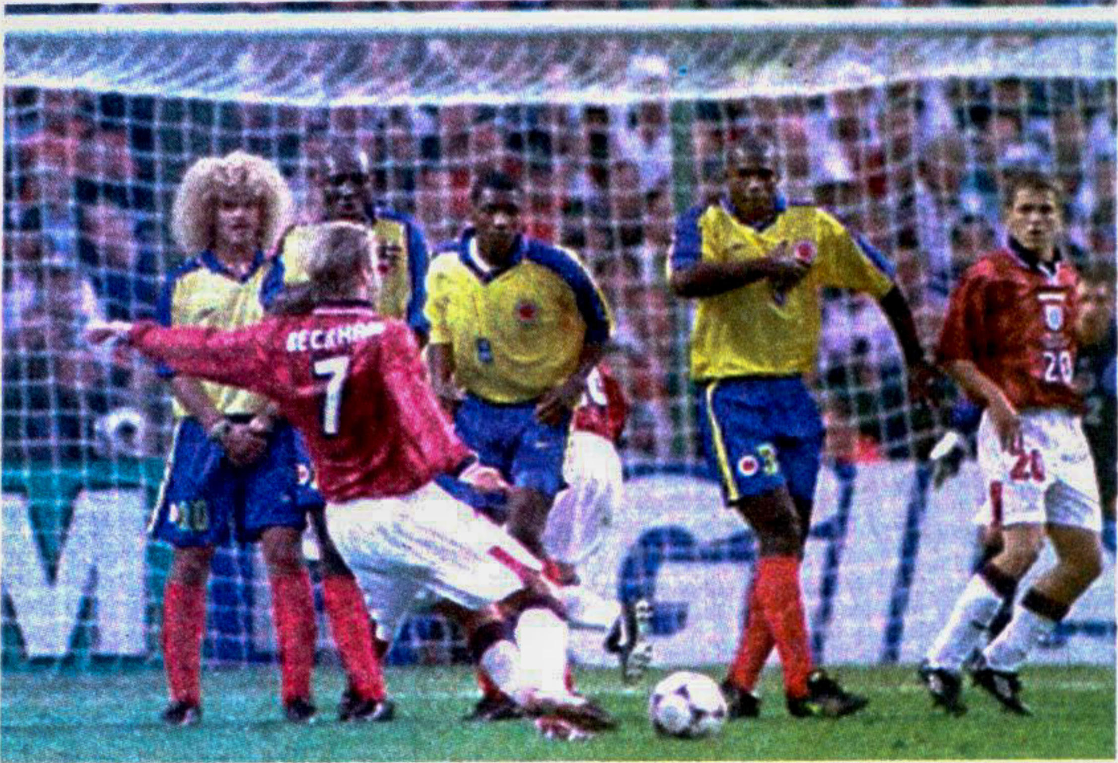
A BECKHAM BEAUTY ABOUT TO UNFOLD: David Beckham about to unleash the lovely curler that found the back of the Colombian net at Lens on June 26.

সংবিধানিক সতর্কীকরণঃ যুগ্মপত্র বাছুরের জন্য স্বতন্ত্র