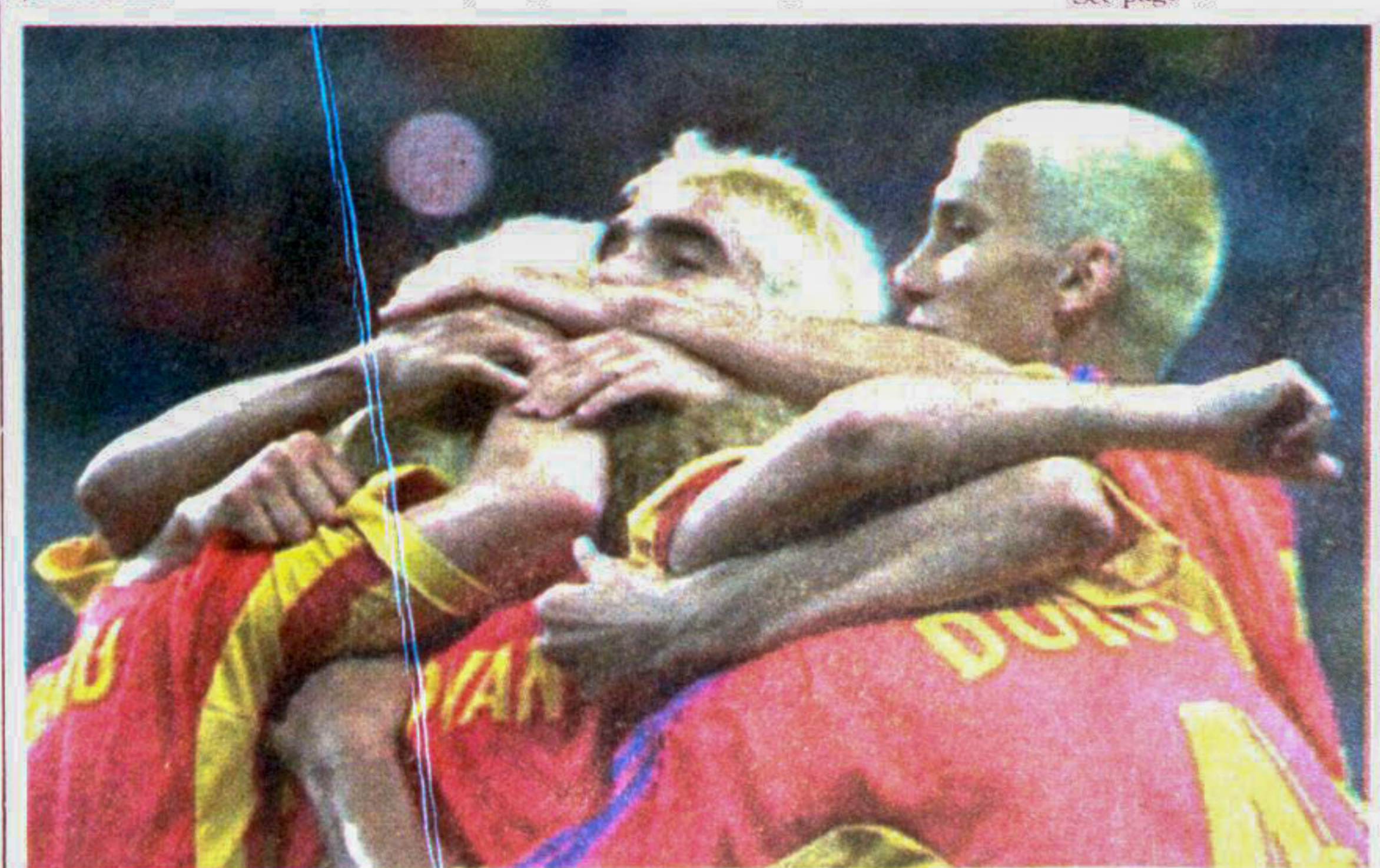
BLOND MESS? Romanian players, sporting a new hair-do, are relieved after Moldovan's equalizer against Tunisia at Saint Denis.