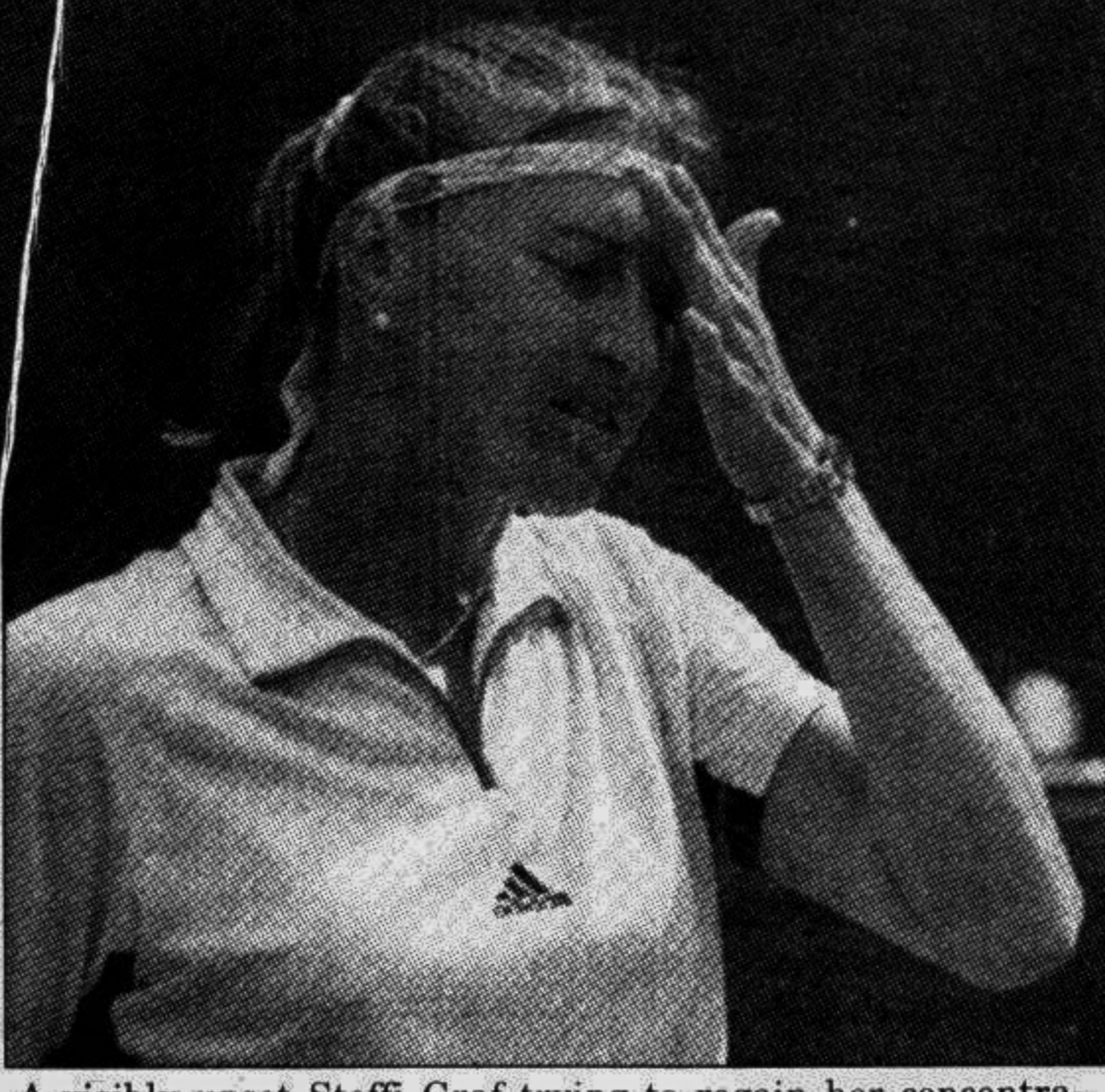
A visibly upset Steffi Graf trying to regain her concentration after losing a point to Natasha Zvereva during their match at the Wimbledon on June 26. Graf lost 4-6, 5-7.