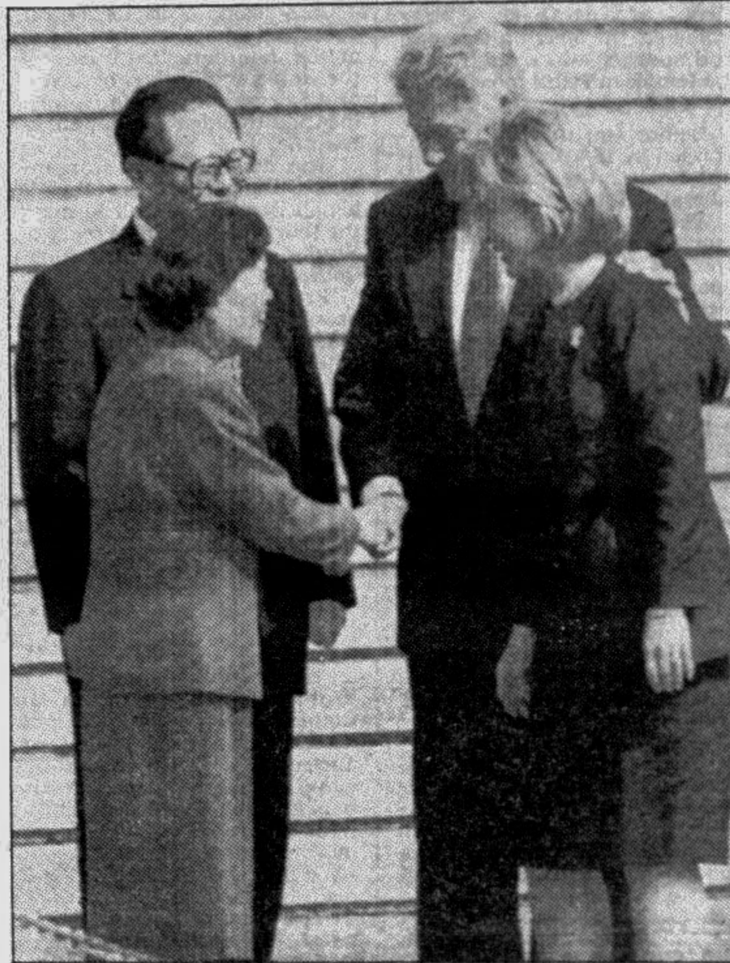
US President Clinton and First Lady Hillary Rodham Clinton greet Chinese President Jiang Zemin and his wife Wang Yeping during a state arrival ceremony at the Great Hall near Tiananmen Square yesterday.

From Page 1 stress that their differences did not derail their strategic alliance, and also struck a landmark deal on re-aiming their missiles targeting each other's cities. Clinton said the pact was a 'counterweight' to the recent Indian and Pakistani nuclear tests. "Clearly a stable, open prosperous China shouldering its responsibilities for a safer world is good for America," Clinton said. "Nothing makes that point better than today's agreement not to target our missiles at each other." Jiang said the two powers were 'partners and not adversaries.' Clinton praised Jiang's government for resisting pressure to devalue its currency, a move many fear would worsen Asia's financial crisis. But they could not agree on terms to allow China entry into the World Trade Organisation, which sets global trade rules. Later Clinton held talks over lunch with Chinese Premier Zhu Rongji. Clinton aides said Zhu reassured Clinton of his government's firm resolve not to devalue the Chinese currency, and they agreed Zhu would pay an official visit to Washington. In an animated manner, Jiang said the fact that the US and Chinese leaders can disagree publicly is a healthy sign for relations. "I think President Clinton is a strong defender of the American interest, and I am a strong defender of the Chinese interest," Jiang said. "But despite that, we still can have very friendly exchanges of views and discussion. And I think that is democracy."