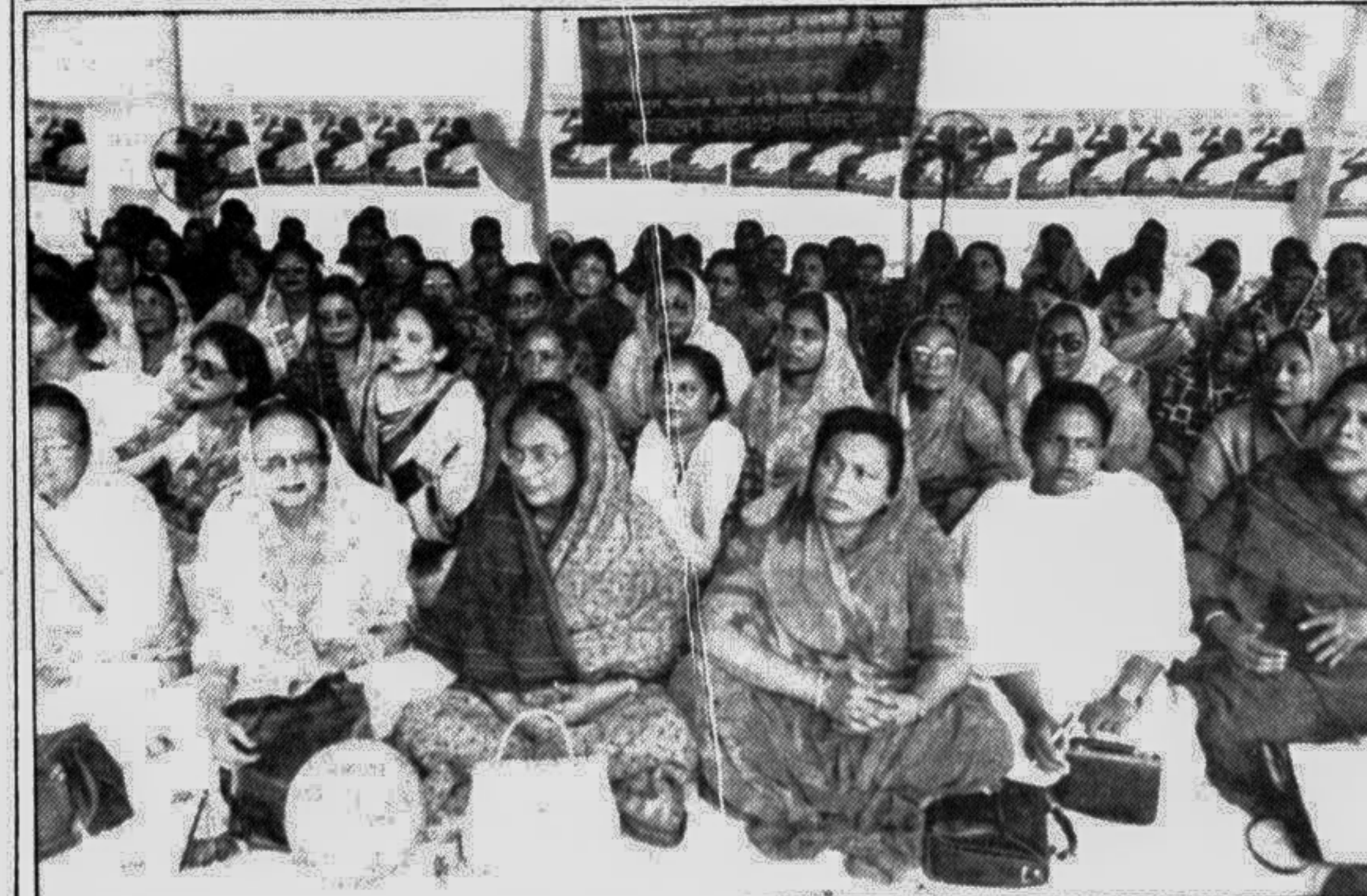
Jatiyatabadi Mahila Dal observed a token hunger strike at Ramna Batamul in the city yesterday protesting alleged rape and abduction of some women by ruling partymen at Simrail near Kanchpur on the night of June 8.