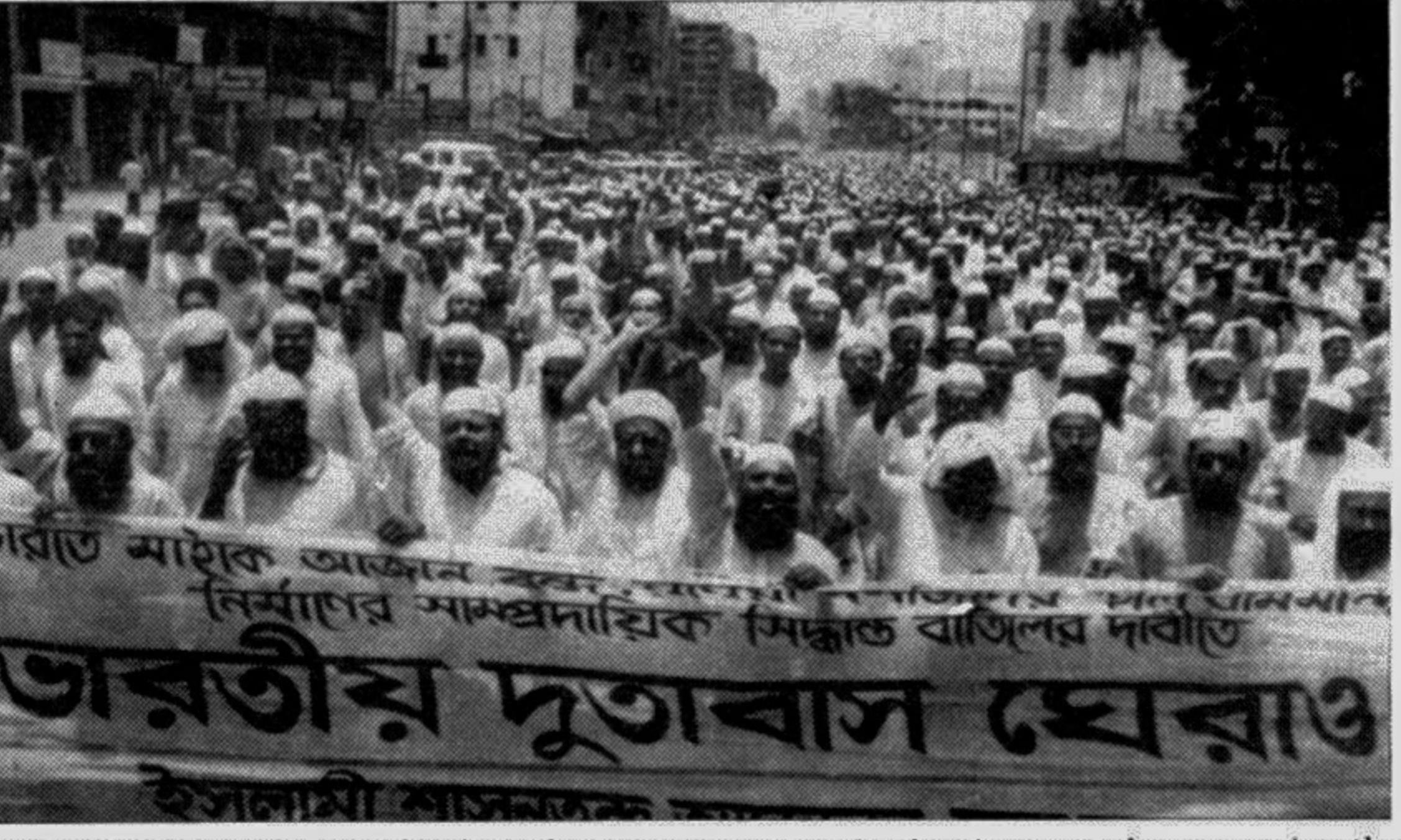
Islami Shasantantra Andolon brought out a procession in the city yesterday protesting the reported move to construct Ram Temple at the Babri Mosque site in Ayodhya.

Speakers at a roundtable conference yesterday emphasised the need for raising awareness about the increasing air pollution and said the government should take an immediate action plan to improve the quality of air, reports BSS.