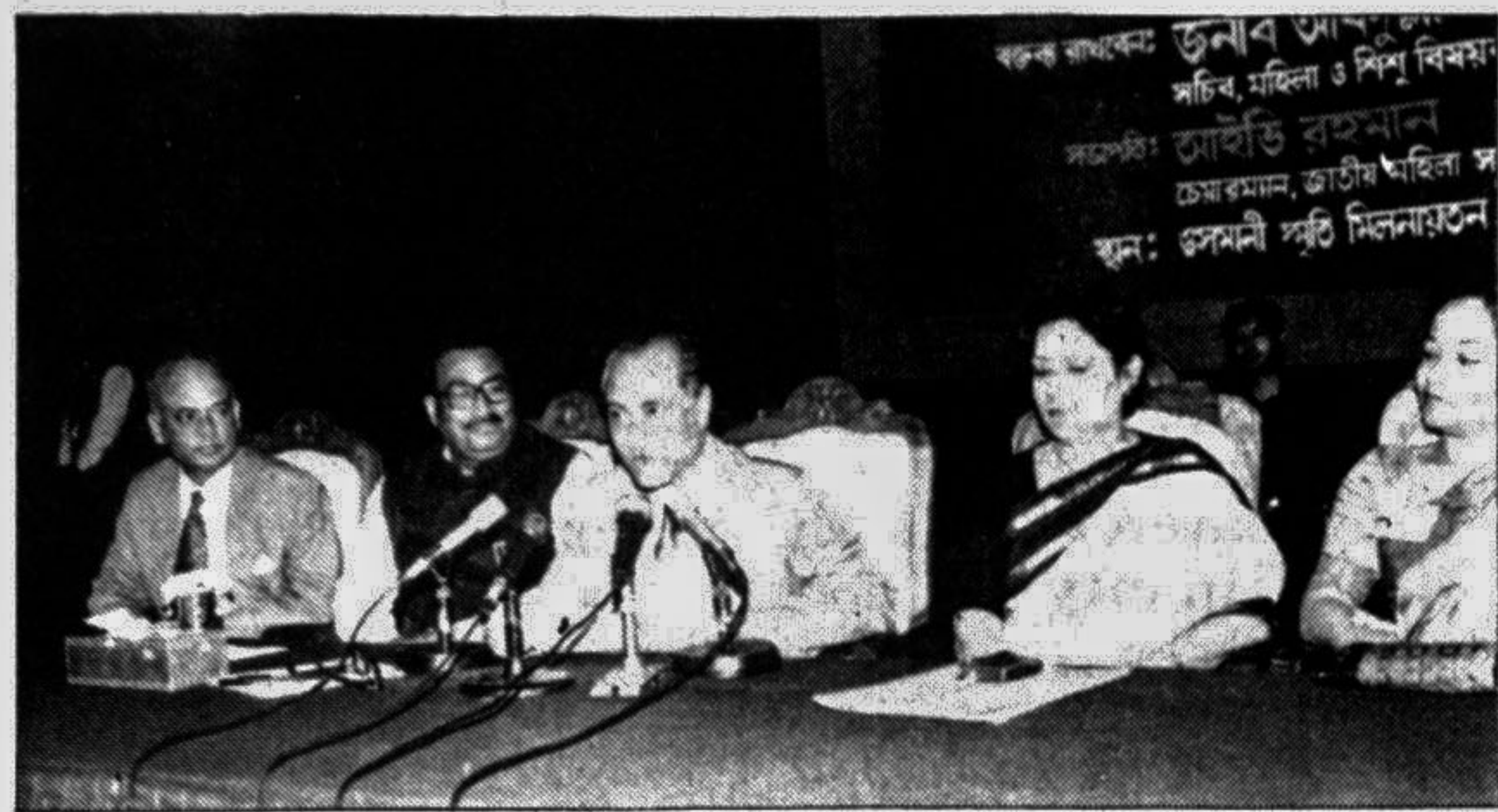
President Justice Shahabuddin Ahmed inaugurated a two-day workshop on 'the bill for enacting special laws regarding prevention of crime relating to women, children and terrorism' at the Osmani Memorial auditorium in the city yesterday.