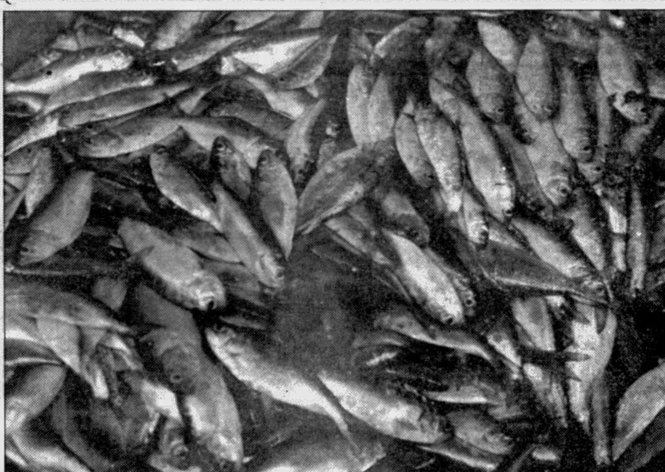
CHANDPUR: Fry of Hilsha being caught regularly in the rivers Meghna and Padma by unscrupulous fishermen.