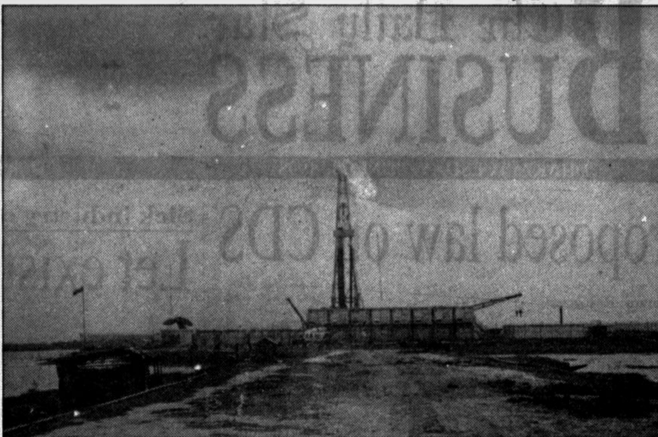
SYLHET: The 'flare test' of gas at Occidental's exploratory well at Bibiana village under Nabiganj thana of Habiganj district is expected to be completed within three to four days.

293 deep tubewells being installed PIROJPUR, June 22: Public Health Engineering Department (PHED) will install some 293 deep tubewells in the district in the current fiscal year to ensure supply of drinking water in the rural areas, reports UNB.