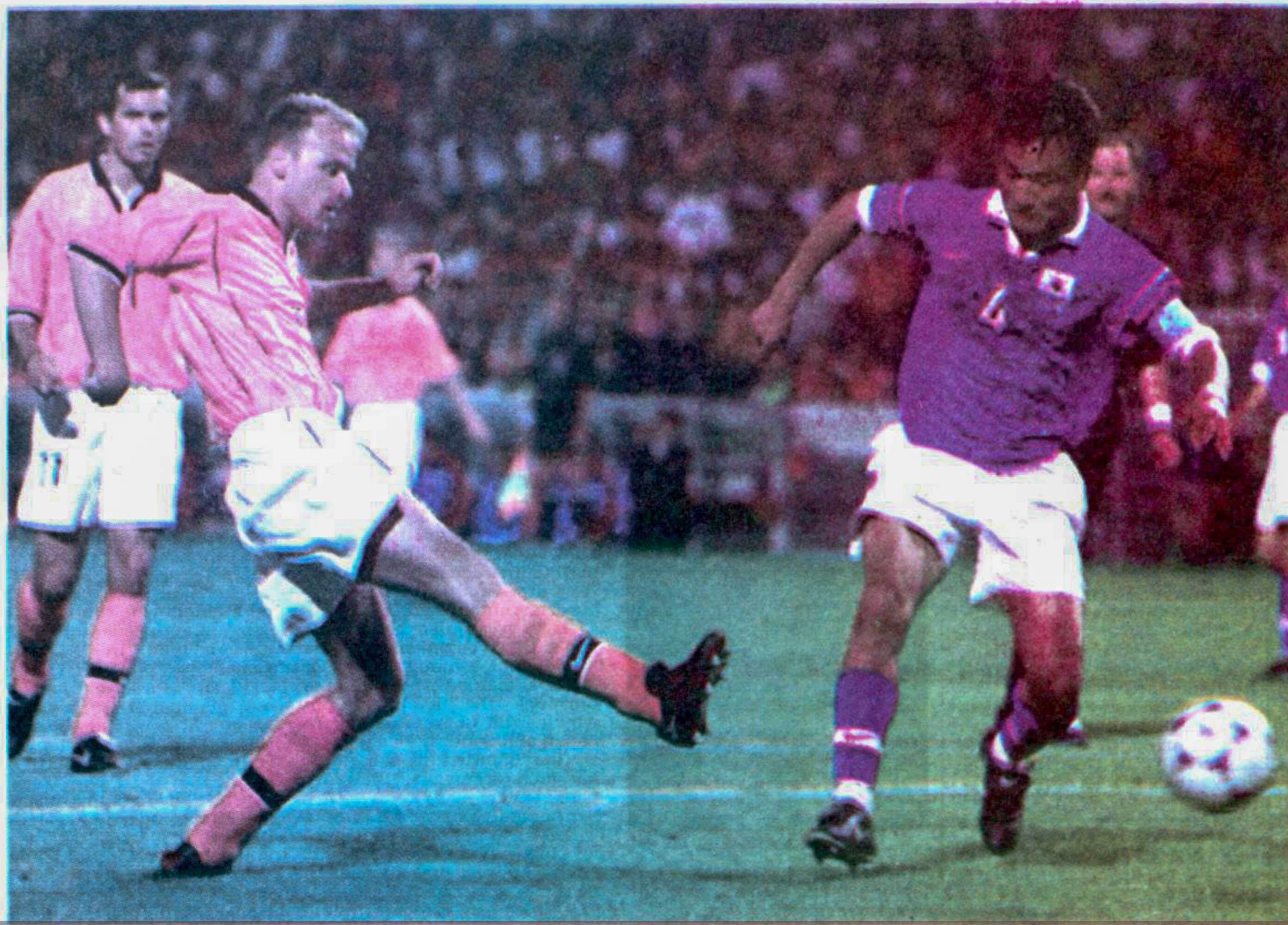
DENNIS GETS ROLLING: Dutch superstar Dennis Bergkamp (C) opens his account against South Korea at Marseille on June 20.