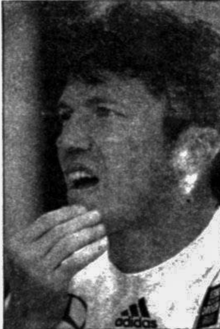
Matthaeus makes history

Klinsmann was stretchered off grimacing in pain in the closing minutes.