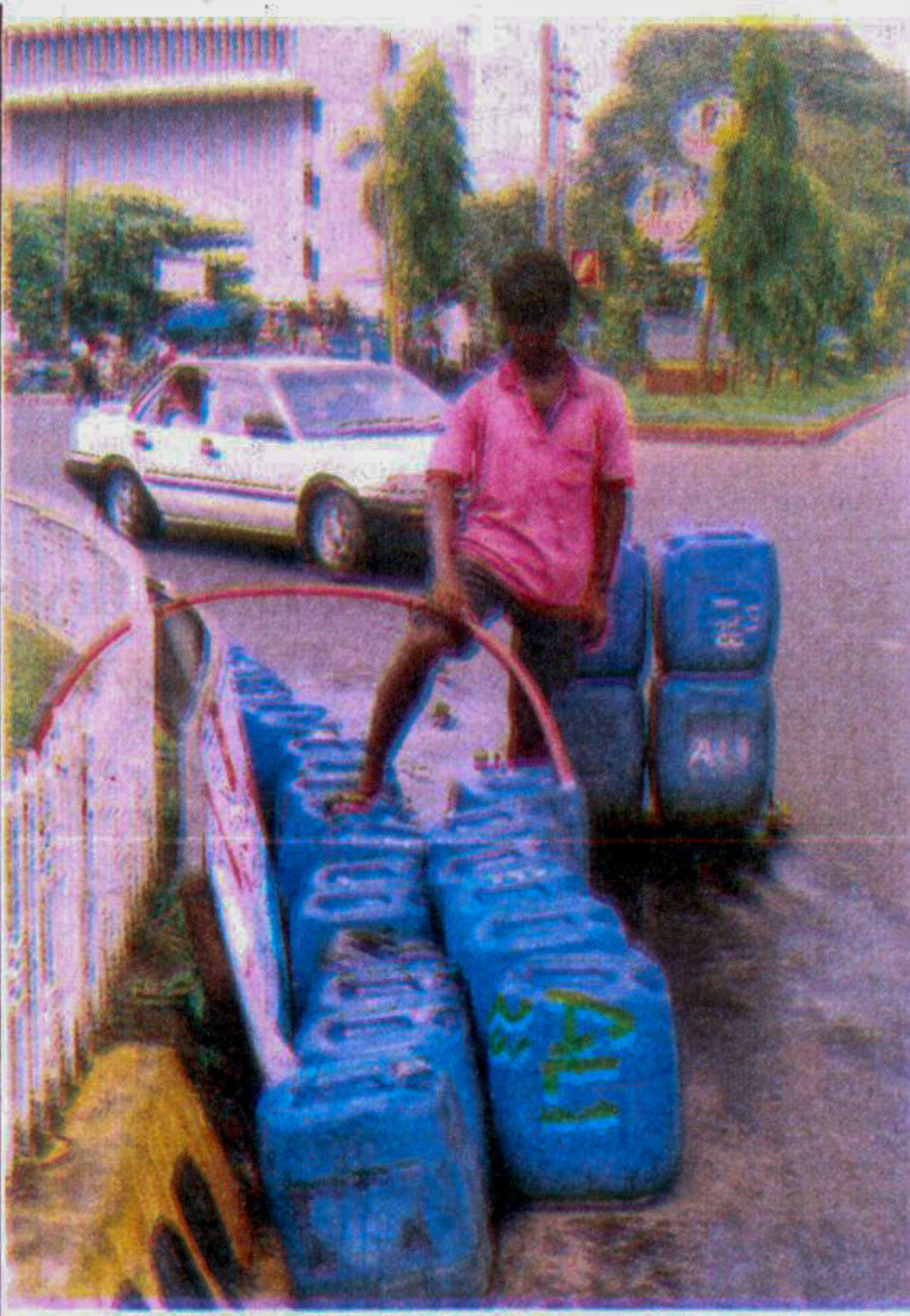
A boy collecting water from the fountain at Shahbagh intersection to supply to some consumers in the area as water crisis continues in the city.

The World Bank recently said the bridge would integrate Bangladesh economy, commerce and communications more than perhaps any other physical infrastructure has done.