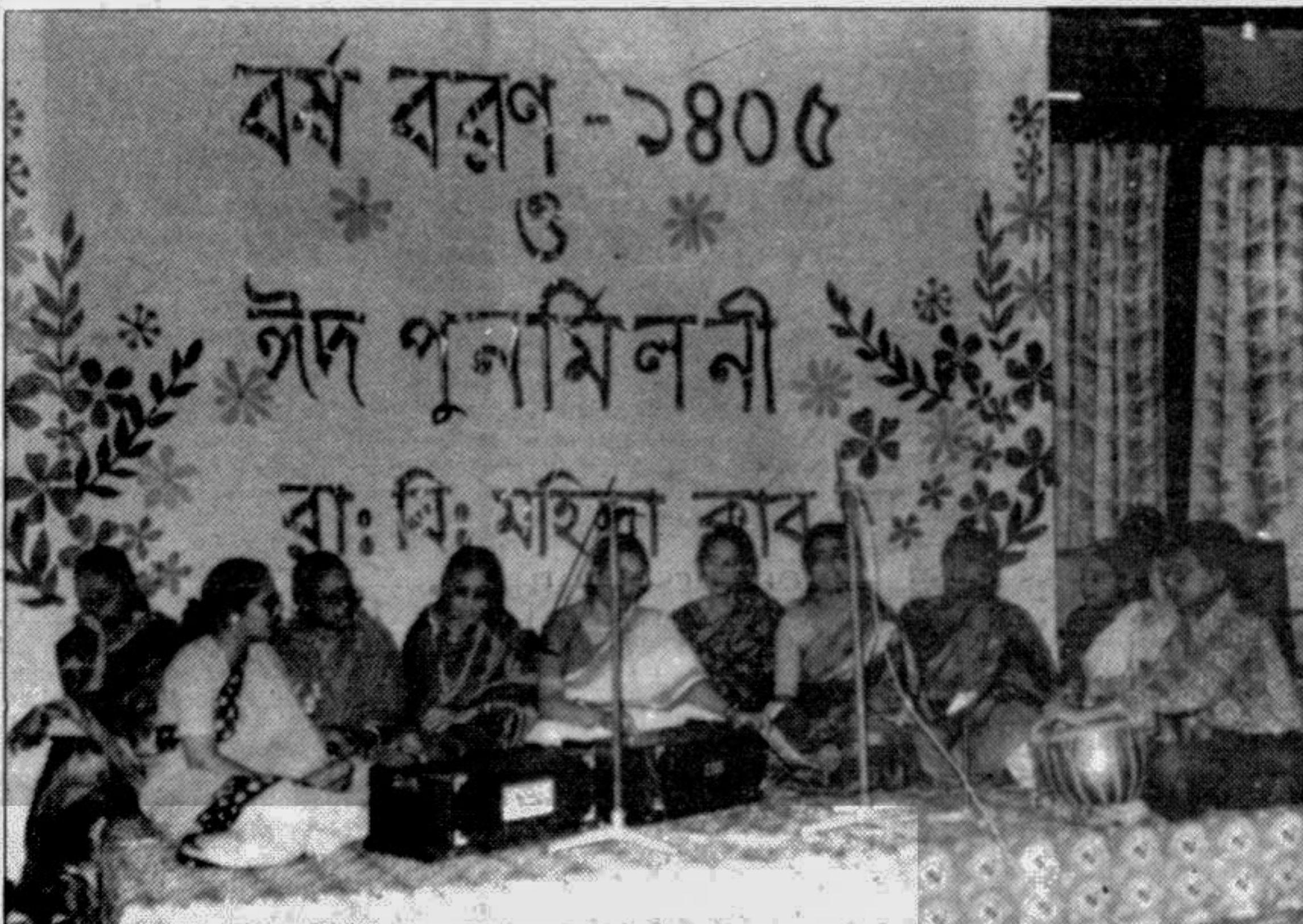
RAJSHAHI UNIVERSITY: Artistes rendering songs at the Eid Reunion function arranged by the university ladies club recently.