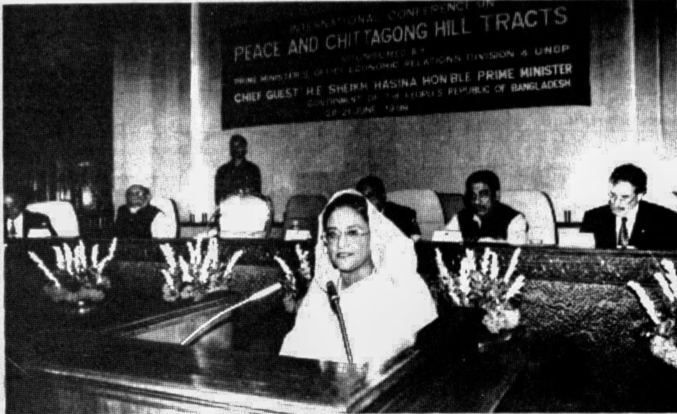
Prime Minister Sheikh Hasina delivering her inaugural speech at the 2-day international conference on 'Peace and Chittagong Hill Tracts' at the International Conference Centre in the city yesterday.

Pitarmann also distributed some saplings free of cost among the villagers on this occasion.