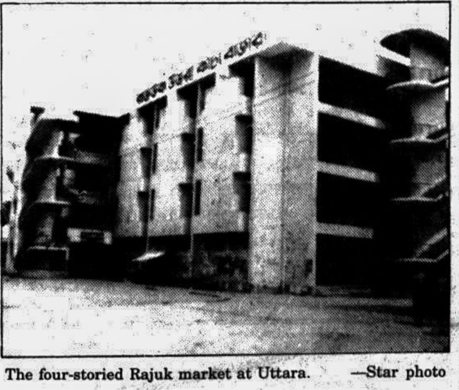
The four-storied Rajuk market at Uttara.

While an unauthorised kitchen market with more than one hundred shops on a huge chunk of public land at Uttara Sector-3 does brisk business, a four-storied modern bazar built by Rajuk remains 'abandoned' hardly 200 yards away at Sector-6. Some Uttara residents said the new kitchen market, built about four years ago at a cost of Tk 3.14 crore, was deliberately kept unused so that the huge chunk of land at Sector-3 beside the Rajuk's staff quarters, could be under control of some mastans. "This is a classic example of how a section of people encourage grabbing of public land in the name of community service and make people pay for it," said a retired government official and resident of Sector-3. Some other residents alleged that the traders at the unauthorised market are so powerful in the locality that it entirely depends on them whether the new Rajuk market can do business or not. There were instances of chasing traders away from the four-storied market after Rajuk tried to attract crowd for business. Mohammad Ruhul Amin, a member of the traders association at the unauthorised market refuted allegation of 'foul play' and said Rajuk's decision to build the four-storied market at Sector-6 was a mistake because it chose a 'backward place' where traders and buyers do not want to go. The Rajuk market with all its modern facilities including car park, broad stairs, waste disposal system and mosaic stalls for fish, vegetable and