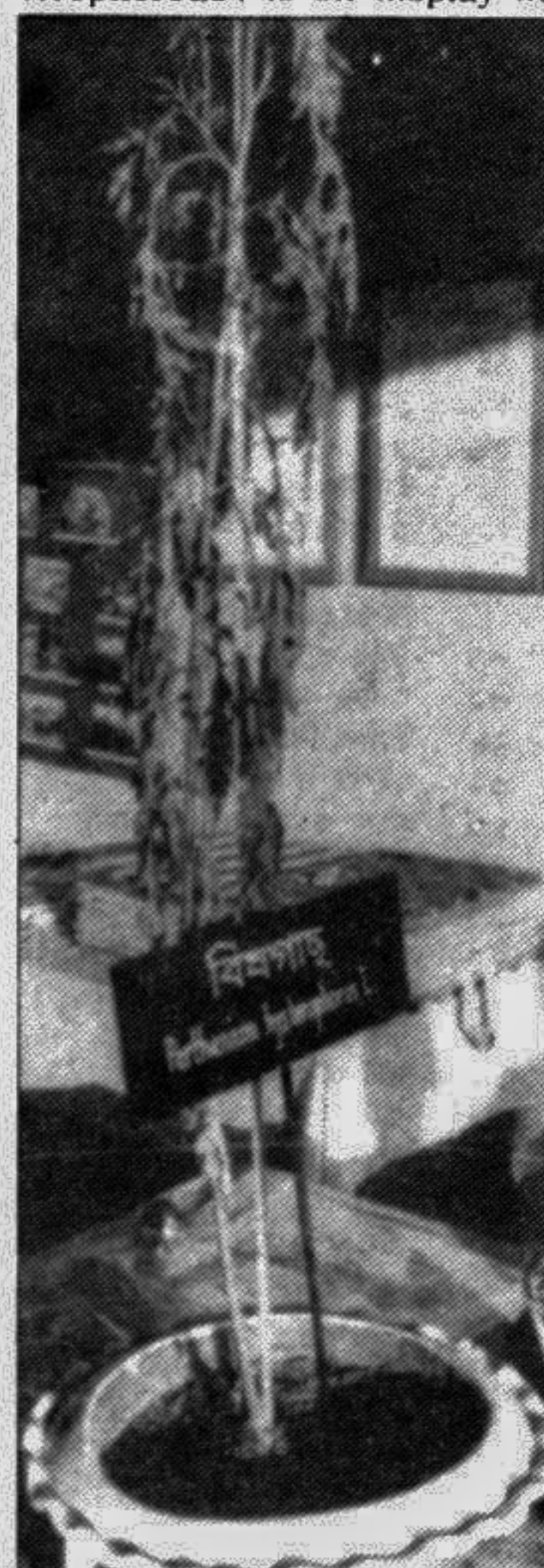
Bishgach, a poisonous plant, sighted in south-western region of the country for some time, is causing concern among plant biologists.