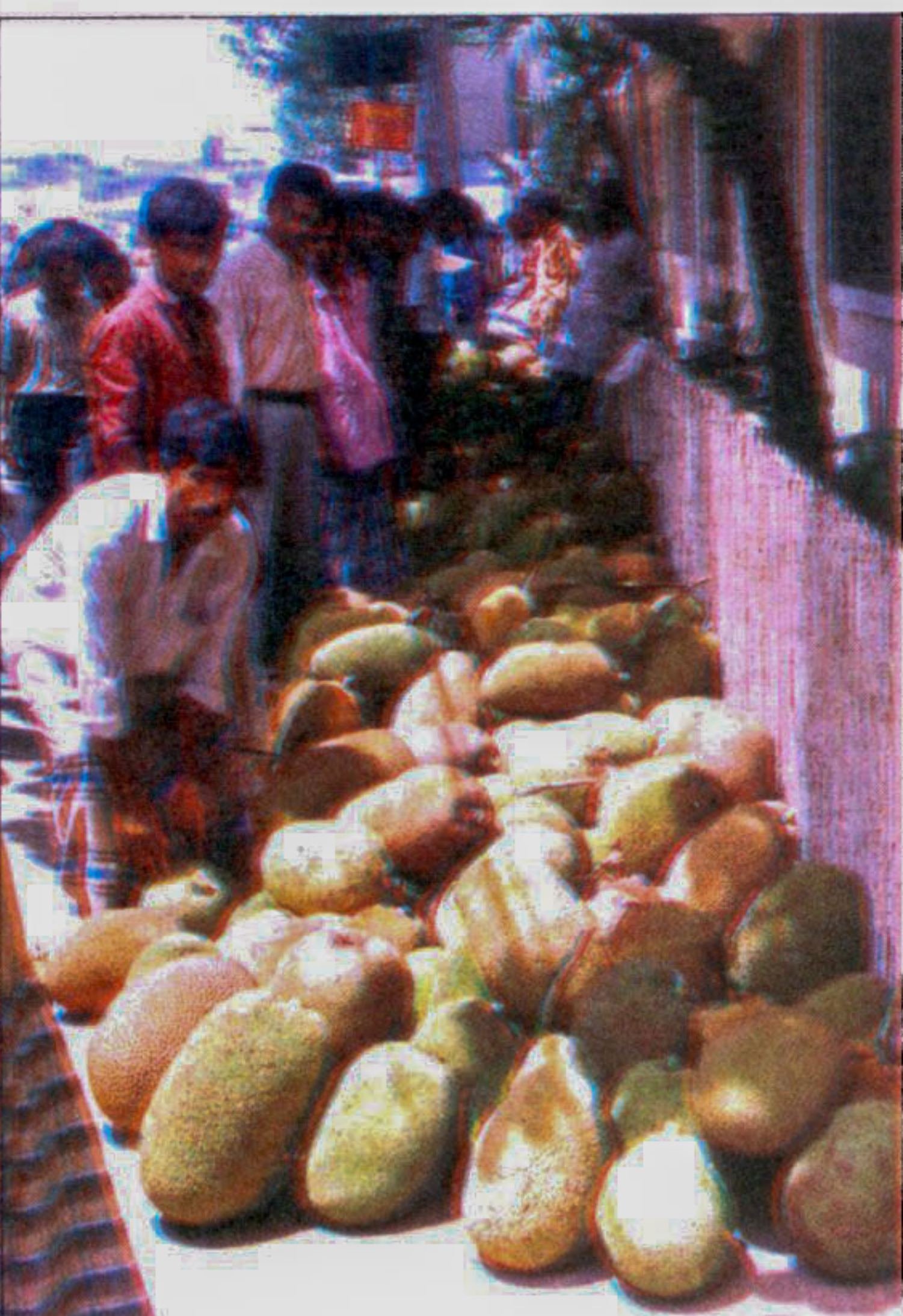
Jackfruit is in abundant supply in the city market now.