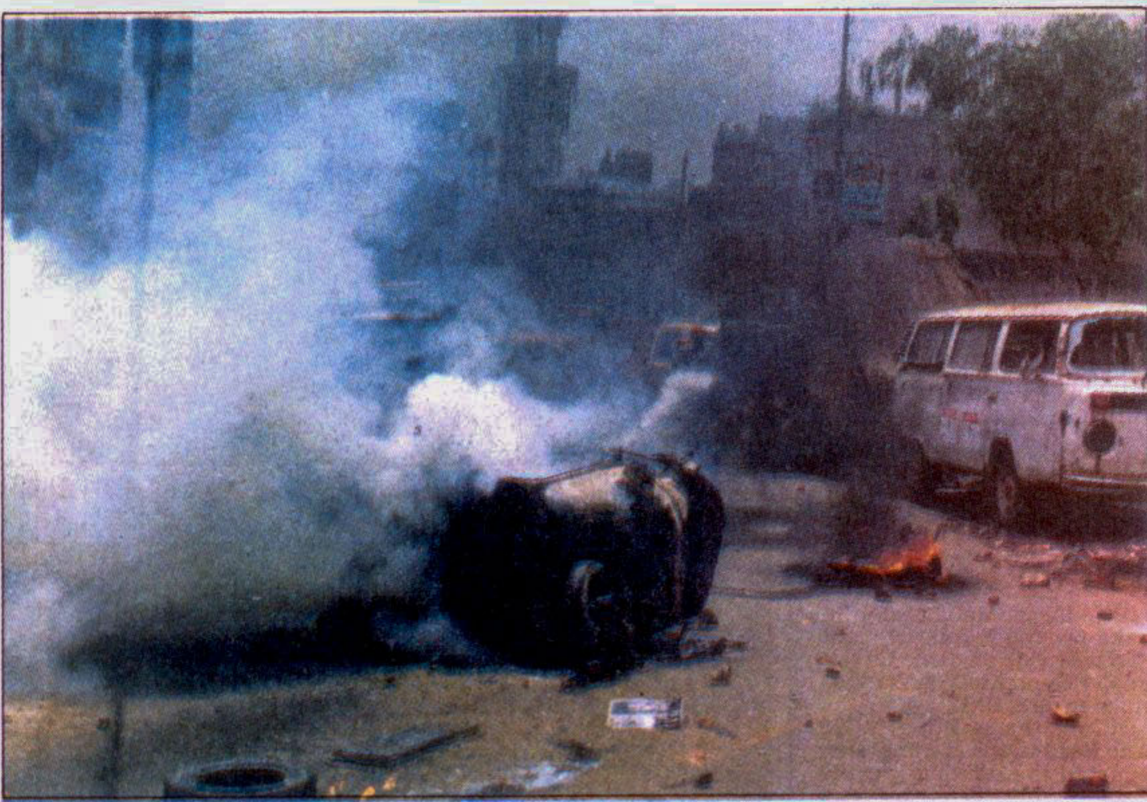
Pickets set afire an autorickshaw of a newspaper at Dolaikhal during hartal hours in the city yesterday.

UNDP's Need Assessment Mission is learnt to have carried out a survey in the three hill districts of Rangamati, Khagrachhari and Bandarban, which will be presented at the conference.