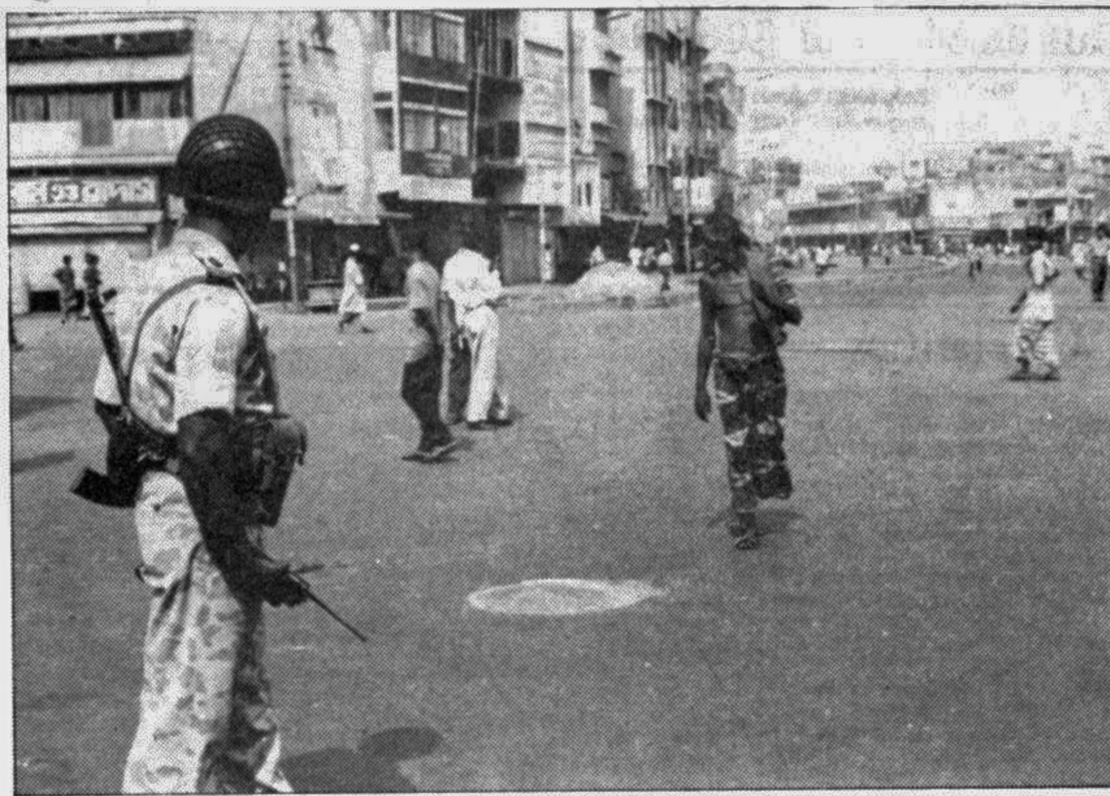
Hartal scenario in the city yesterday: A BDR-man seen patrolling the city's North-South Road during the hartal hour yesterday.

Siazon is chairman this year of the Association of Southeast Asian Nations, which holds a meeting of its ASEAN Regional Forum, a security grouping, in Manila on July 27.