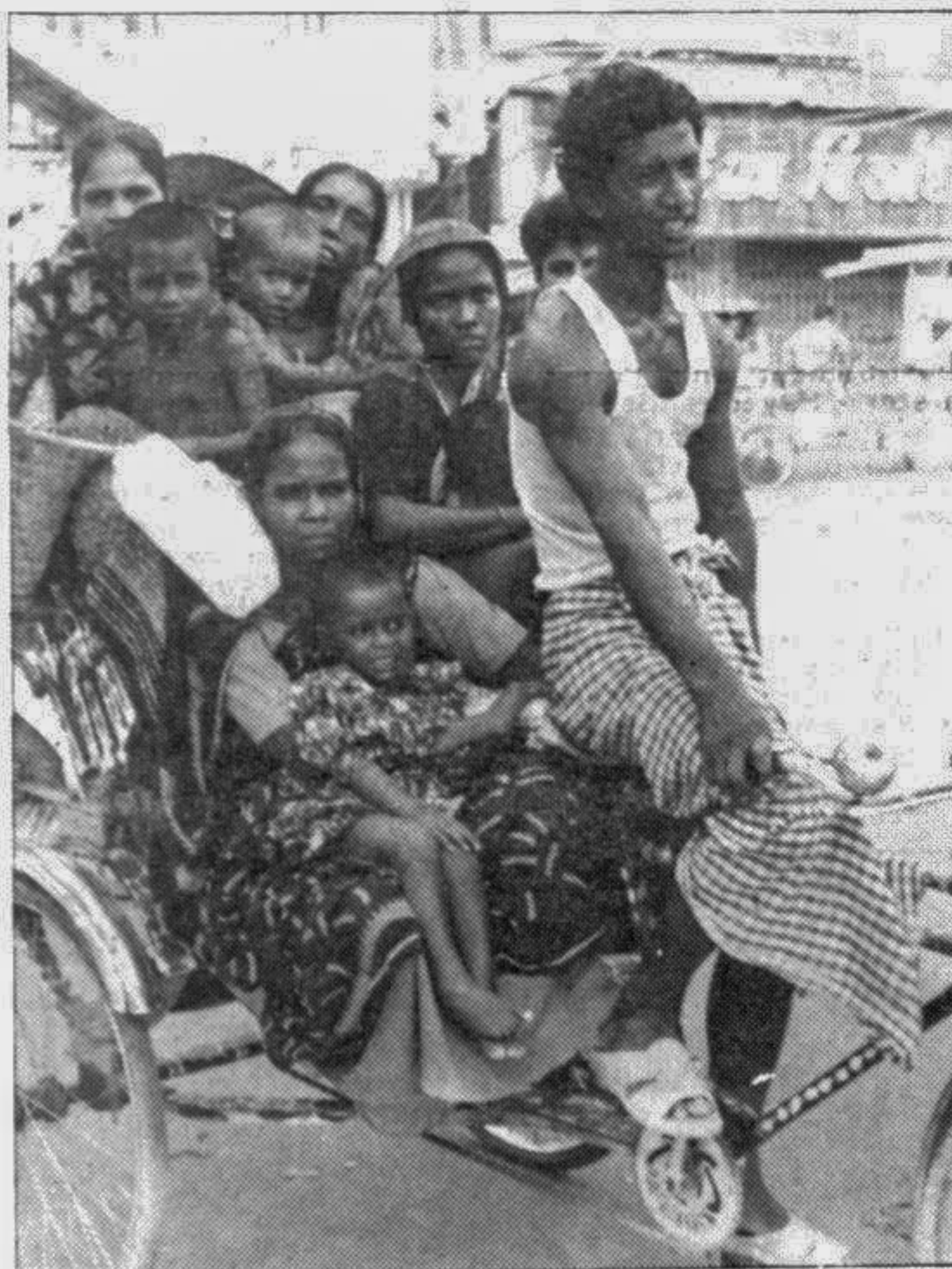
A rickshaw full of passengers is plying on the city street during hartal. The passengers are being carried away from Sadarghat to unknown destination.

They said, "the opposition should do their politics for the interest of the people, not for a particular interest group."